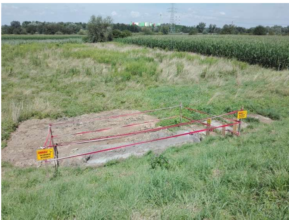
Foto. 72. Securing dangerous places – the right embankment of the Vistula River on section 3.3 , condition in the third decade of July 2021 (view downstream).