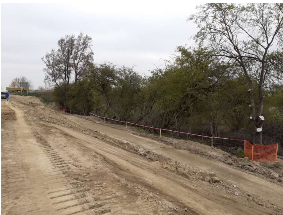
Foto. 78. Securing trees and shrubs not planned for felling and preventive pruning of tree branches – the right Vistula embankment on section 3.2a , condition in the second decade of April 2022 (view upstream).