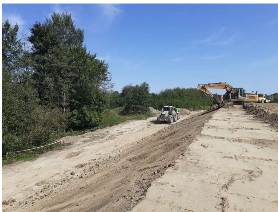
Foto. 104. Leveling the slopes of the flood embankment – the right embankment of the Vistula River on section 3.4 , state in the first decade of September 2022 (view downstream).