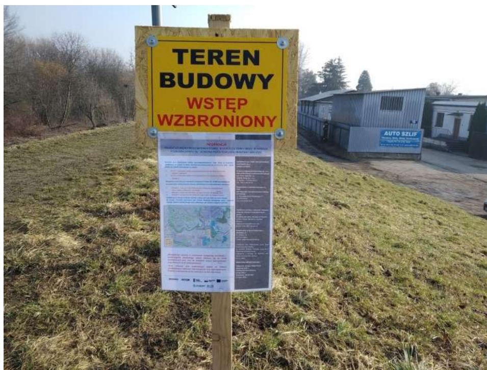
Foto. 68. Construction site marking – the right Vistula embankment on section 3.1 , condition in the second decade of March 2021 (view downstream).