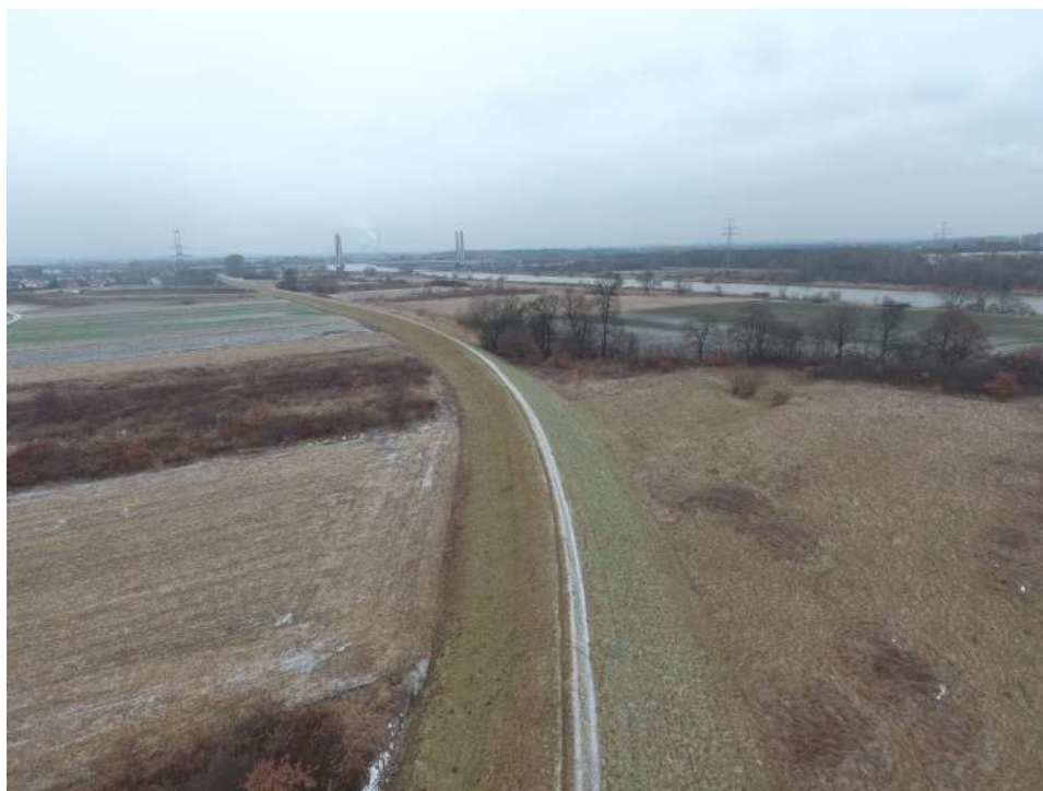
Foto. 61. Condition of the area before the commencement of works – the right Vistula embankment planned for reconstruction on section 3.3 – lower part, condition in the first decade of February 2021 (view upstream).