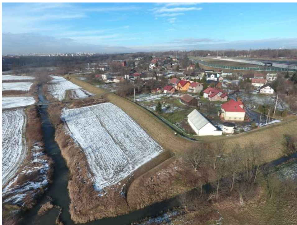
Foto. 5. Condition of the area before the commencement of works – left embankment of Dłubnia planned for reconstruction on section 1.5 , condition in the first decade of February 2021 (view upstream).