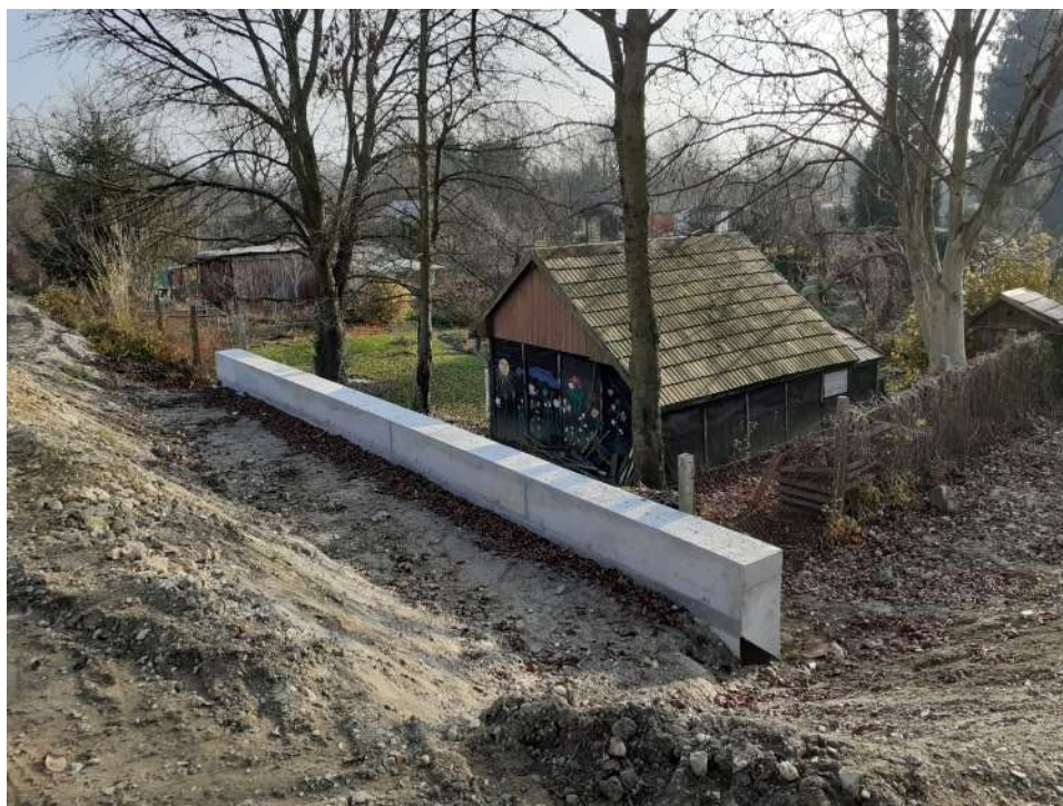
Foto. 95. Construction of a retaining wall – the right Vistula embankment on section 3.2a , state in the second decade of November 2021 (view downstream).