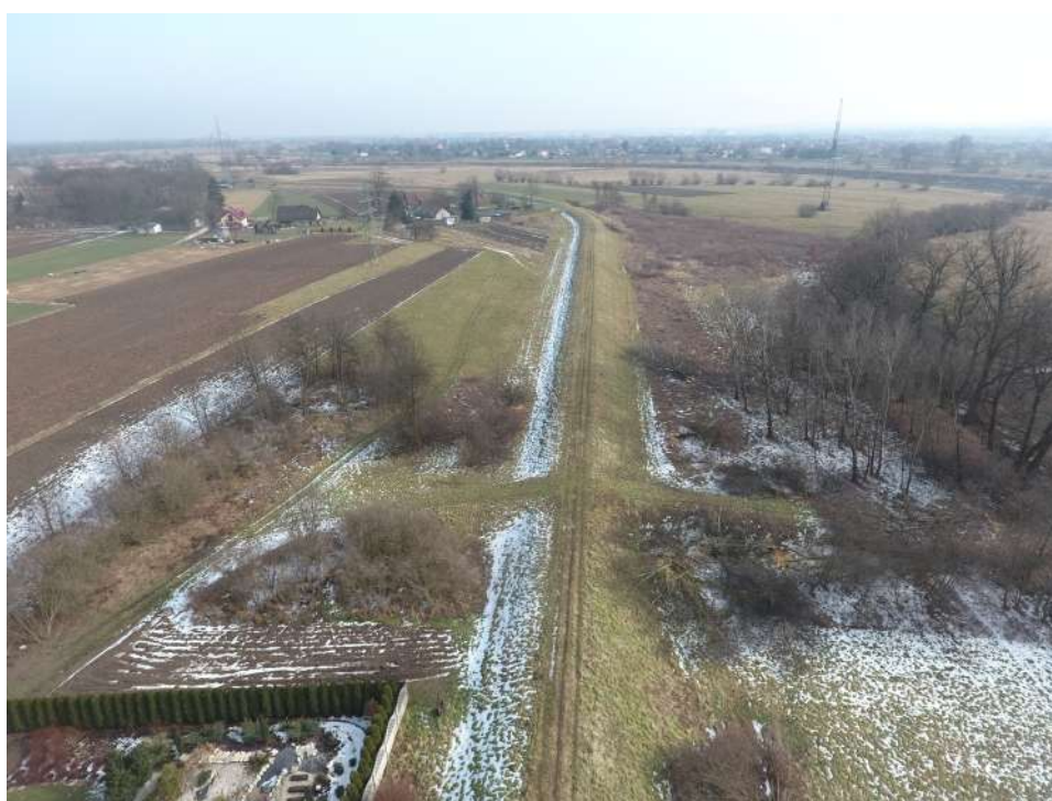
Foto. 8. Condition of the area before the commencement of works – left Vistula embankment planned for reconstruction on section 2 – lower part, condition in the third decade of February 2021 (view downstream).