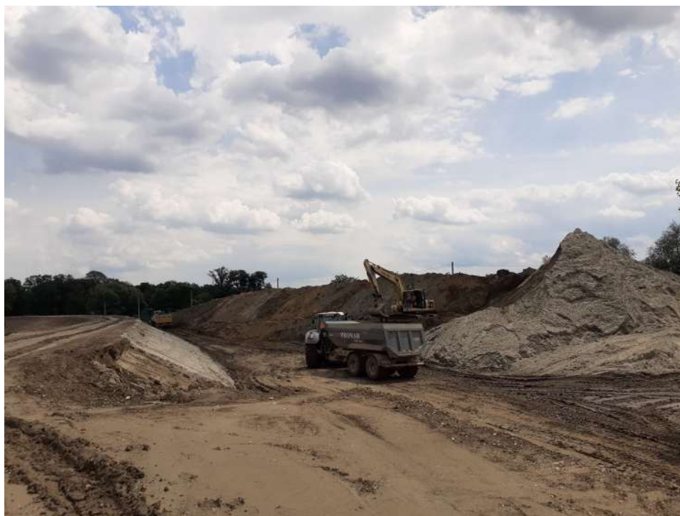
Foto. 99. Transport of earth masses for the reconstruction of the flood embankment – the right embankment of the Vistula River on section 3.2a , state in the first decade of July 2022 (view downstream).