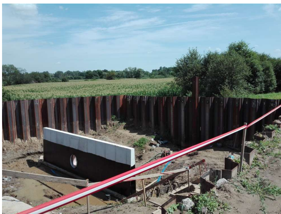
Foto. 94. Reconstruction of the embankment culvert – the right embankment of the Vistula River on section 3.4 , condition in the third decade of July 2021 (view upstream).