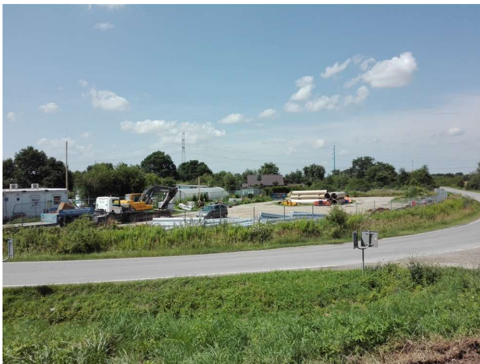
Foto. 65. Construction camp on the right bank of the Vistula embankment – the right bank of the Vistula on section 3.4 , state in the third decade of July 2021 (view towards the west).