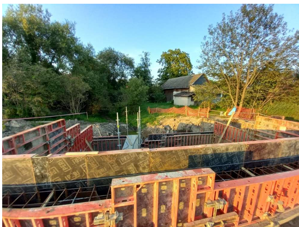
Foto. 34. Construction of the embankment culvert - left embankment of Dłubnia on section 1.6 , condition in the third decade of August 2022 (view towards the embankment).