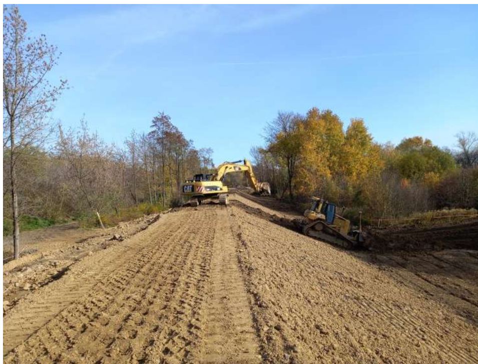
Foto. 37. Formation of flood embankment slopes – left Vistula embankment on section 1.2 , condition in the third decade of October 2021 (view downstream).