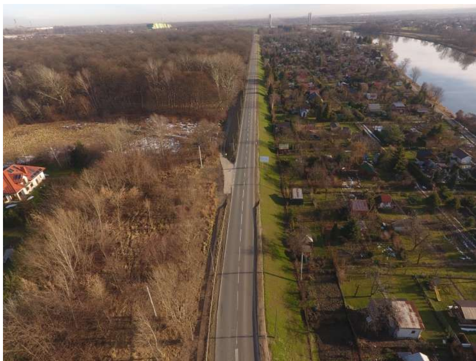
Foto. 49. Condition of the construction site in the last quarter of the works implementation period – rebuilt left Vistula embankment on section 1.1 , condition in the third decade of December 2022 (view downstream).