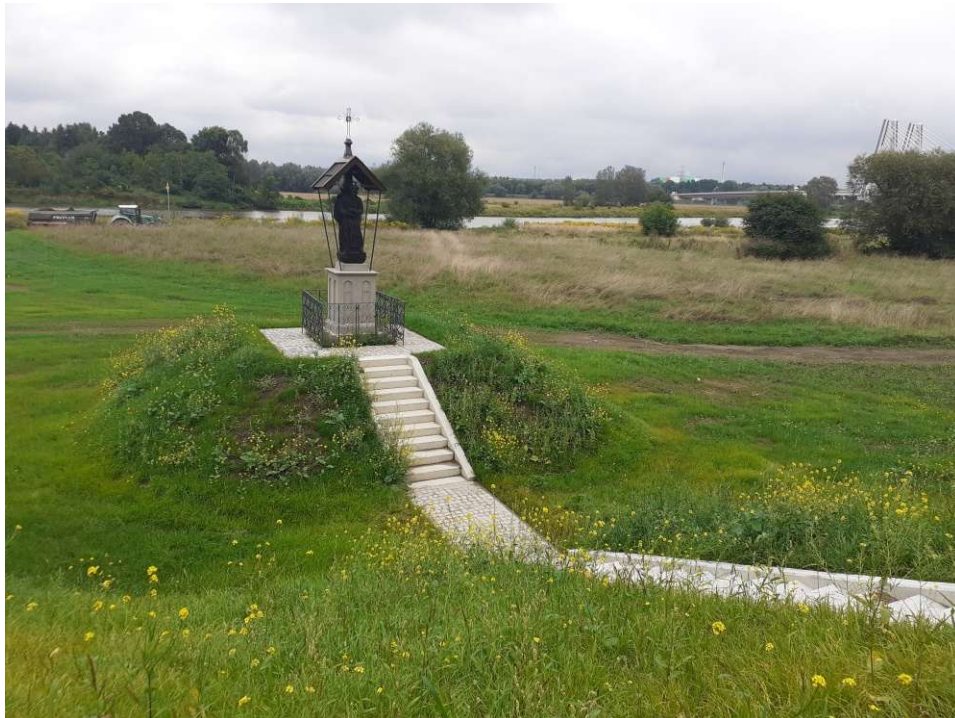
Foto. 82. Rebuilt historic chapel on the Vistula River embankment – right bank of the Vistula River on section 3.3 , state in the third decade of August 2023 (view downstream).