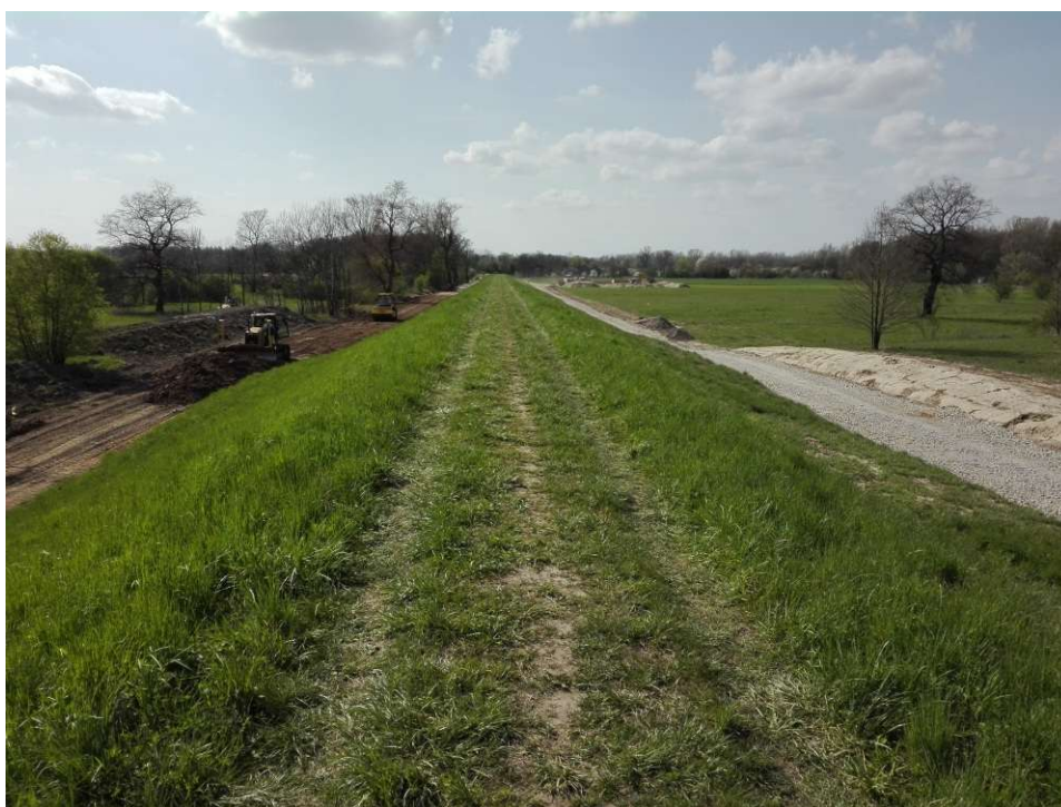
Foto. 26. Removing the topsoil layer – left Vistula embankment on section 2 , condition in the third decade of July 2021 (view upstream).