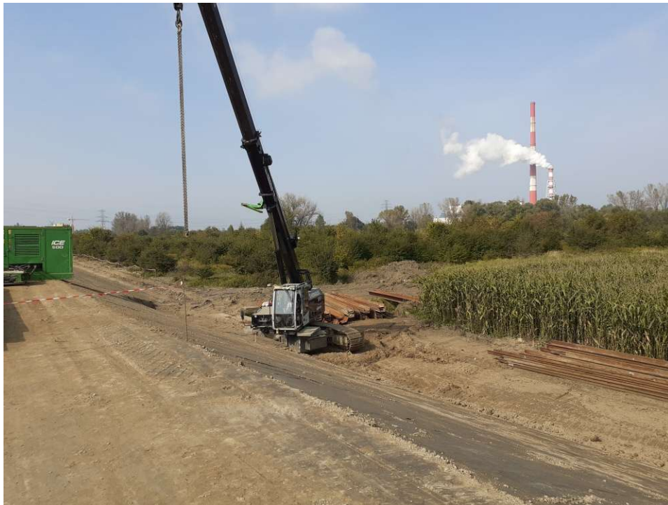
Foto. 91. Construction of a sheet pile wall securing the reconstructed embankment culvert – the right embankment of the Vistula River on section 3.2a , condition in the third decade of September 2021 (view upstream).