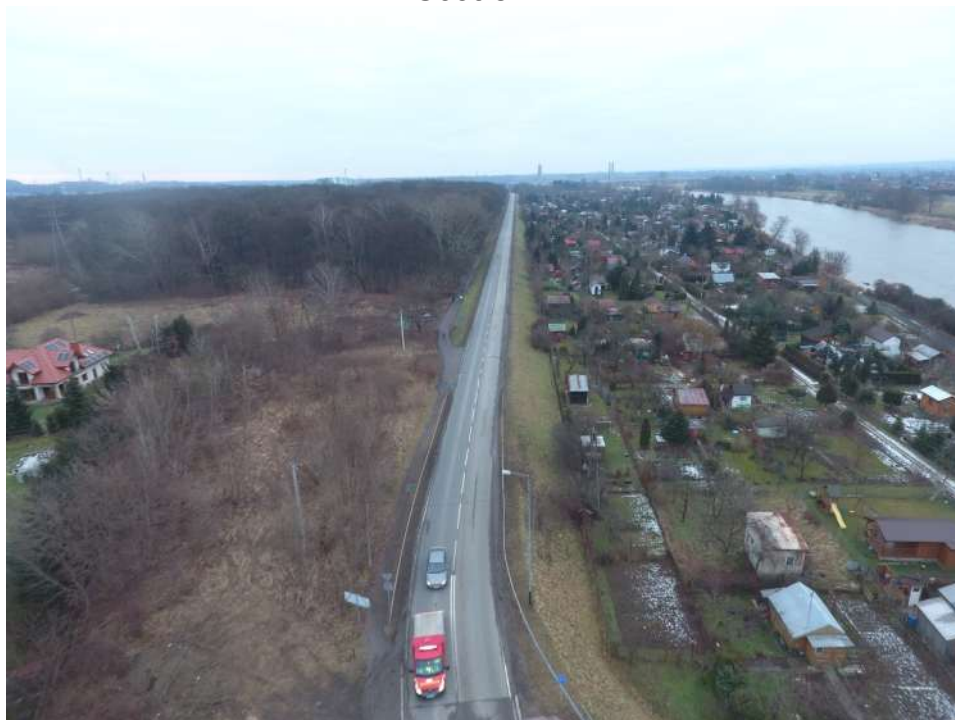
Foto. 1. Condition of the area before the commencement of works – the left Vistula embankment planned for reconstruction on section 1.1 , condition in the first decade of February 2021 (view downstream).