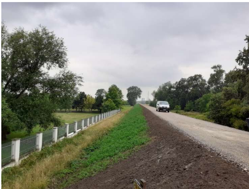
Foto. 111. Growth of grasses sown on the slope of the flood embankment – the right embankment of the Vistula River on section 3.3 , state in the second decade of July 2023 (view upstream).