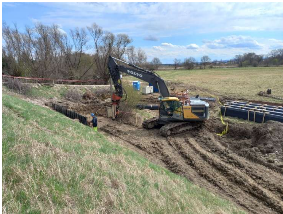
Foto. 31. Construction of a sheet pile wall at the base of the embankment – left Vistula embankment on section 1.1 , state in the first decade of April 2022 (view downstream).