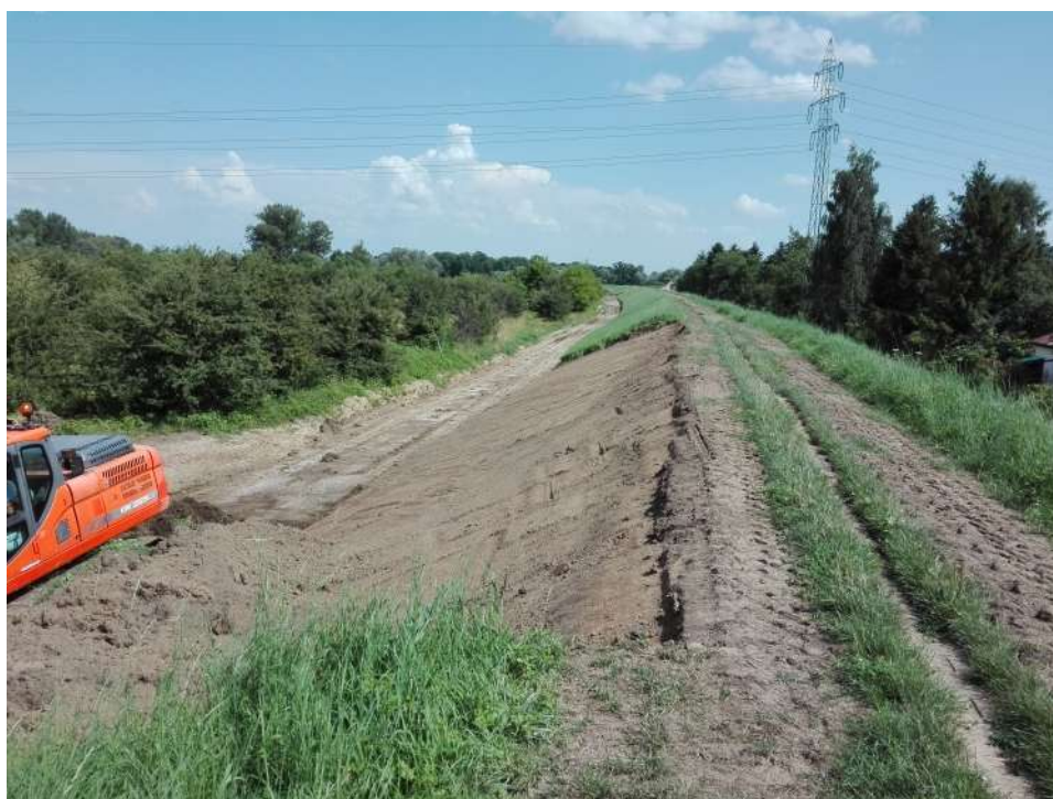
Foto. 86. Removing the topsoil layer – the right Vistula embankment on section 3.2a , condition in the third decade of July 2021 (view downstream).