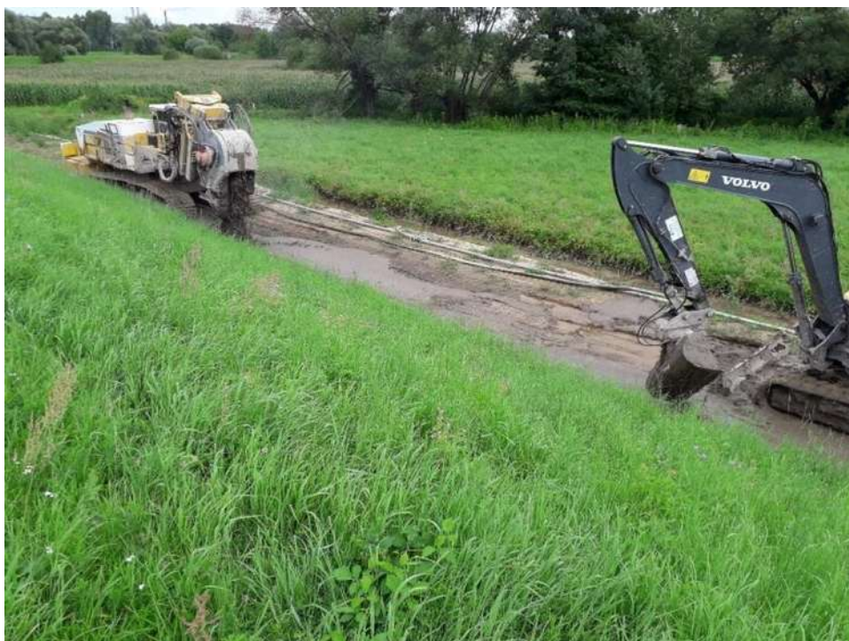
Foto. 29. Construction of a cement-bentonite barrier at the base of the embankment – the right embankment of Dłubnia on section 1.4 , condition in the second decade of August 2021 (view upstream).