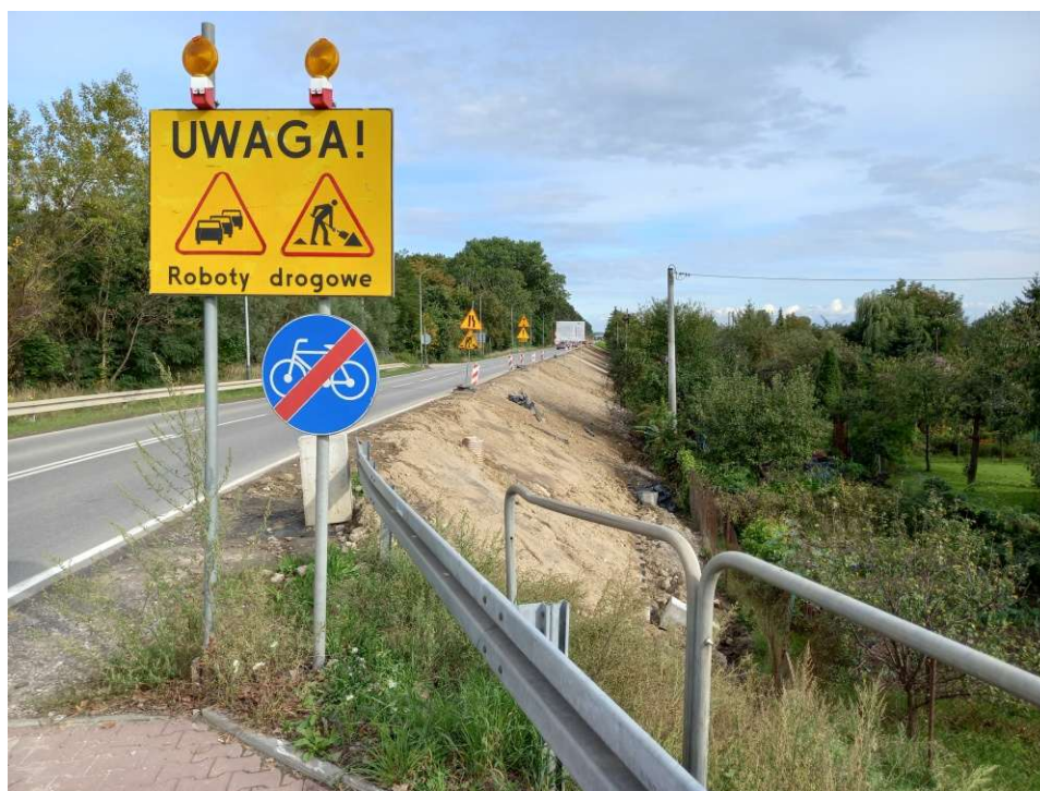
Foto. 15. Public road marking in the vicinity of the construction site – the right embankment of the Vistula River on section 1.1 , condition in the third decade of September 2022 (view downstream).