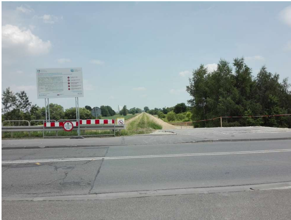
Foto. 67. Construction site marking – the right Vistula embankment on section 3.3 , condition in the third decade of June 2021 (view downstream).