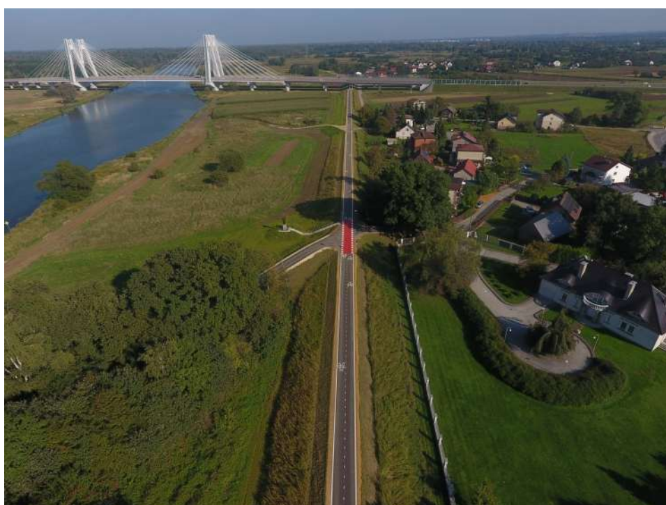
Foto. 116. Condition of the construction site in the last quarter of the works implementation period – rebuilt right Vistula embankment on section 3.3 – upper part , condition in the third decade of September 2023 (view downstream).