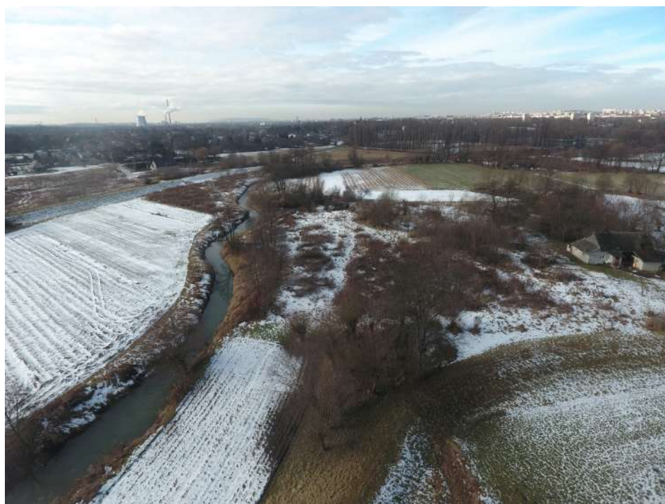
Foto. 6. Condition of the area before the commencement of works – area of planned construction of the left embankment of Dłubnia on section 1.6 , condition in the first decade of February 2021 (view upstream).