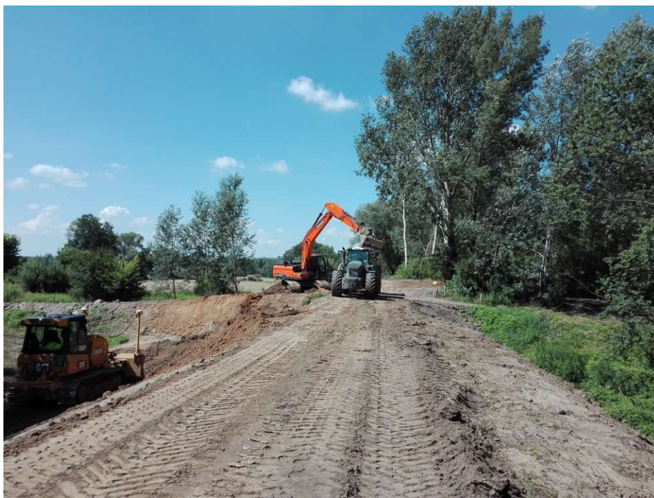
Foto. 25. Removing the topsoil layer – left Vistula embankment on section 1.3 , condition in the third decade of July 2021 (view upstream).