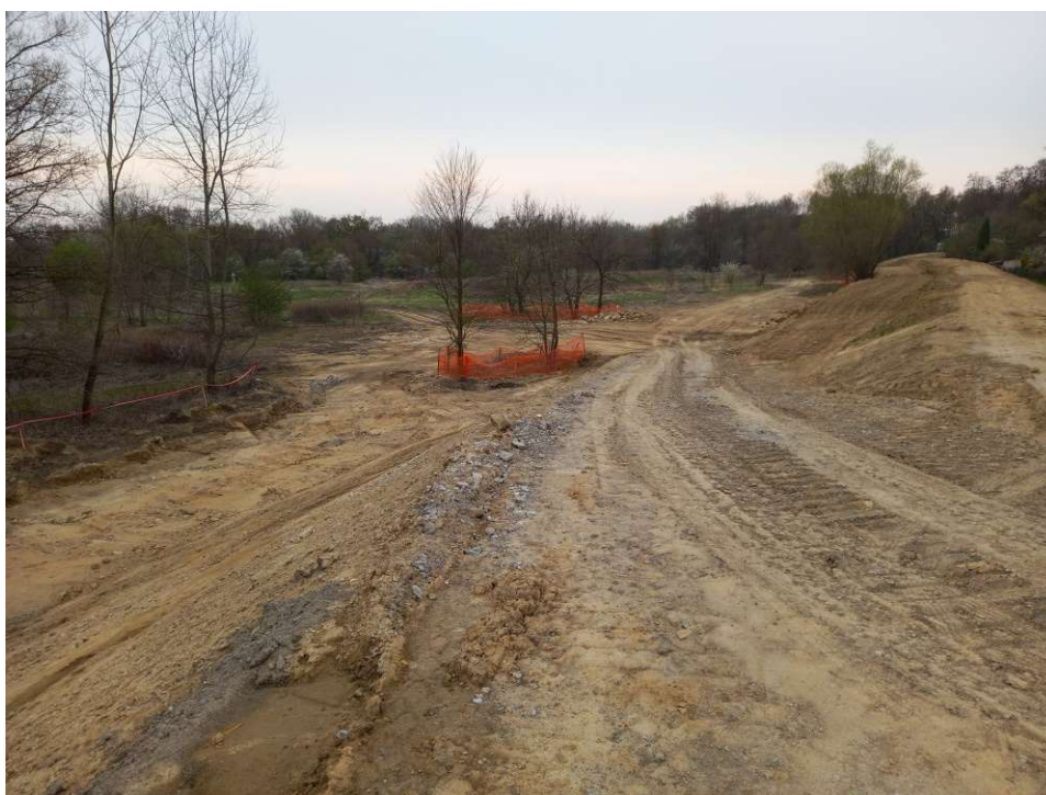
Foto. 22. Securing trees and shrubs not planned for cutting – left Vistula embankment on section 2 , state in the second decade of April 2022 (view upstream).