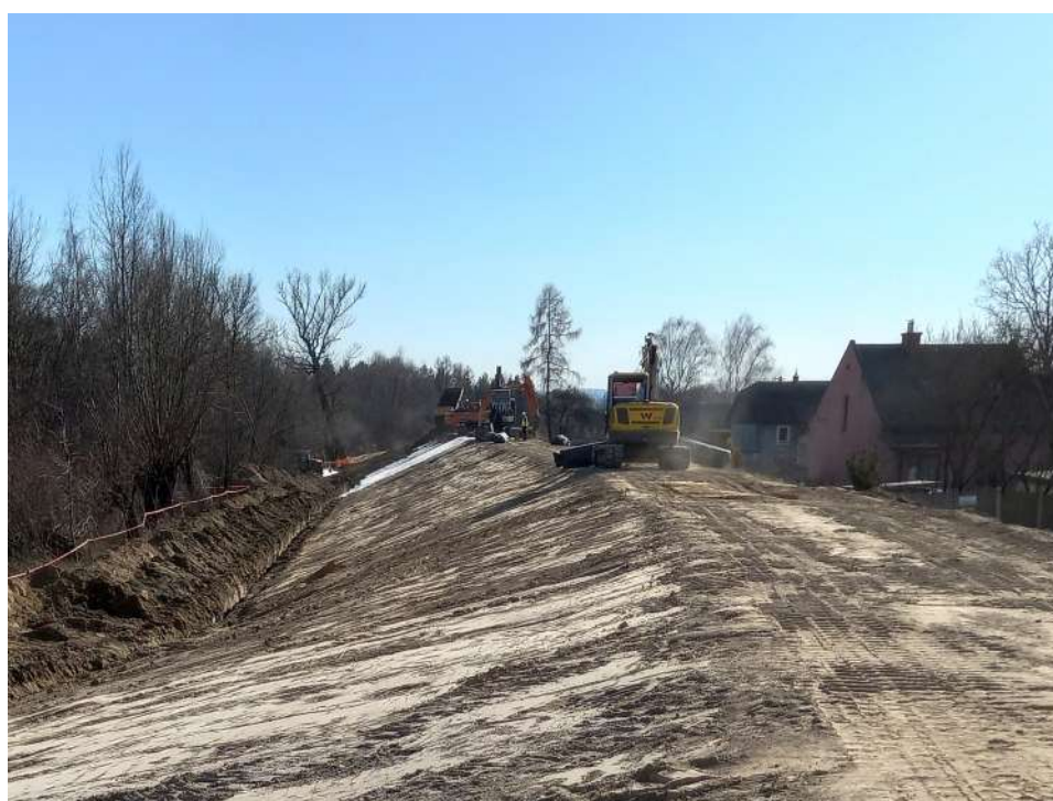
Foto. 42. Laying bentomat on the slope of the flood embankment – right embankment of Dłubnia on section 1.4 , condition in the third decade of March 2021 (view downstream).