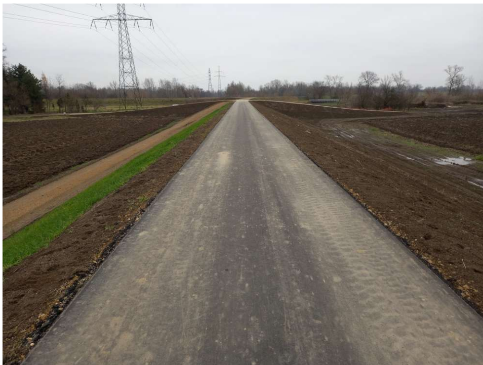
Foto. 46. Construction of a road on the top of the flood embankment – left Vistula embankment on section 2 , state in the third decade of November 2022 (view downstream).