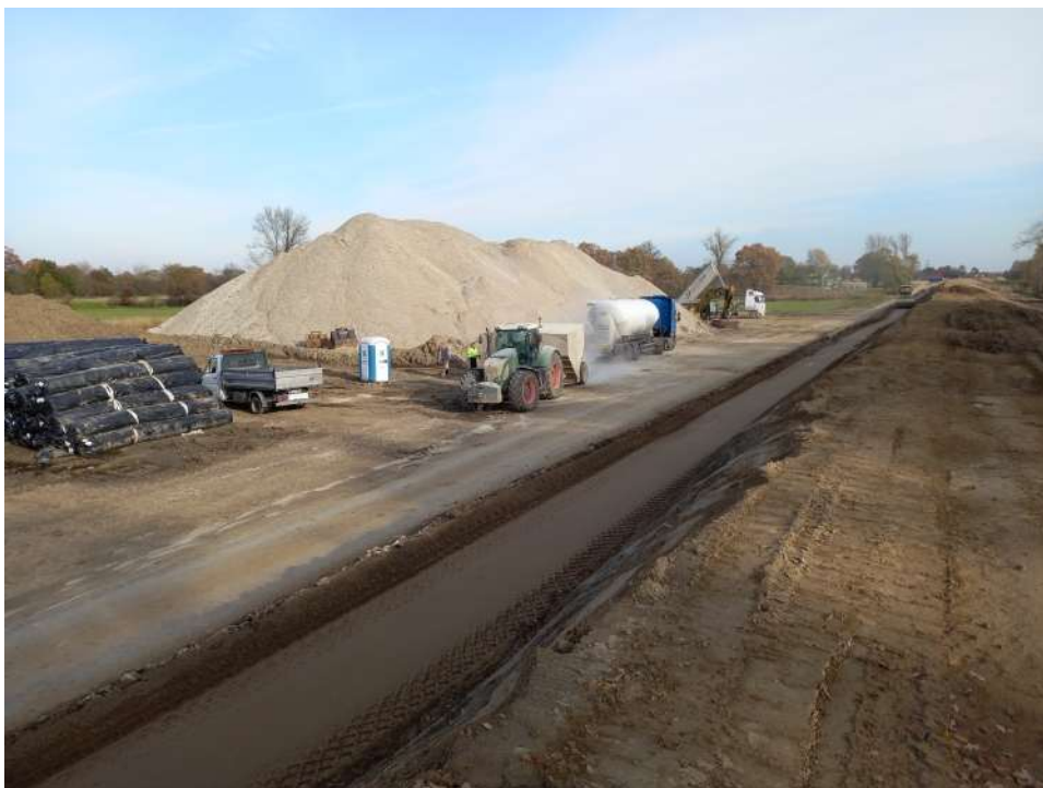
Foto. 12. Storage yard on the left bank of the Vistula embankment – left bank of the Vistula on section 2 , state in the third decade of October 2021 (view downstream).