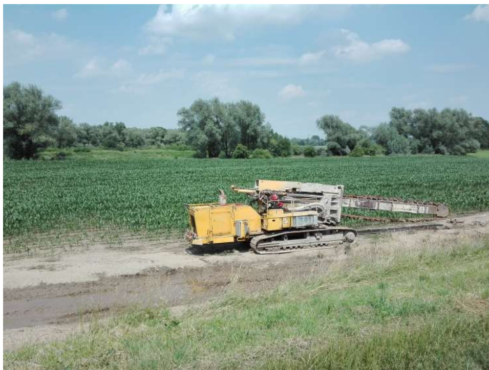
Foto. 89. Construction of a cement-bentonite barrier at the base of the embankment – the right embankment of the Vistula River on section 3.2a , condition in the third decade of June 2021 (view downstream).