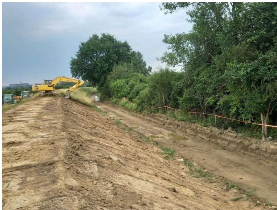
Foto. 85. Removing the topsoil layer – the right Vistula embankment on section 3.4 , state in the first decade of July 2022 (view upstream).