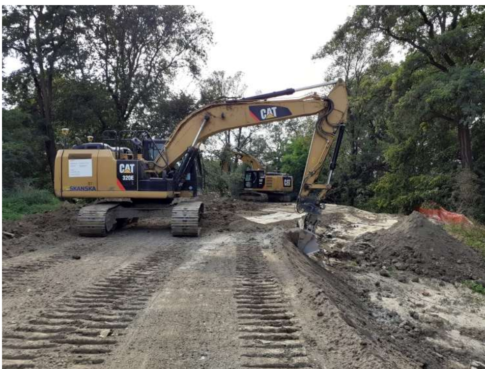
Foto. 102. Formation of flood embankment slopes – right Vistula embankment on section 3.2a , state in the first decade of September 2022 (view downstream).