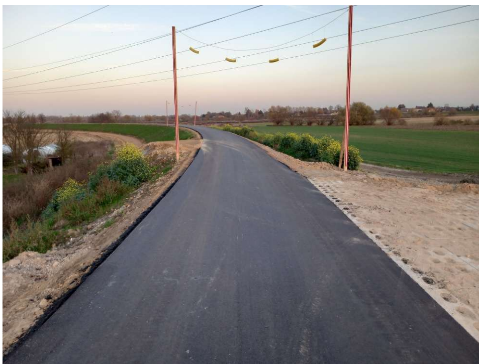
Foto. 20. Securing dangerous places under the power line – left Vistula embankment on section 2 , state in the third decade of October 2022 (view downstream).