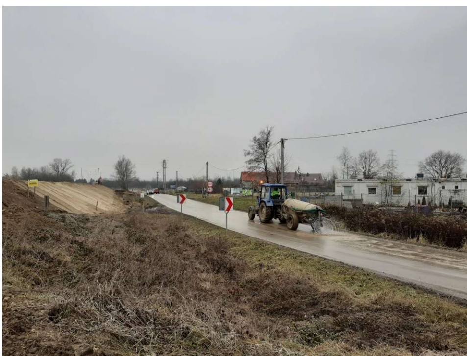
Foto. 84. Maintaining the cleanliness of public roads in the vicinity of the construction site – right bank of the Vistula River on section 3.4 , state in the third decade of November 2022 (view downstream).