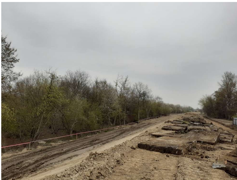
Foto. 77. Securing trees and shrubs not planned for cutting – the right Vistula embankment on section 3.1 , condition in the second decade of April 2022 (view downstream).