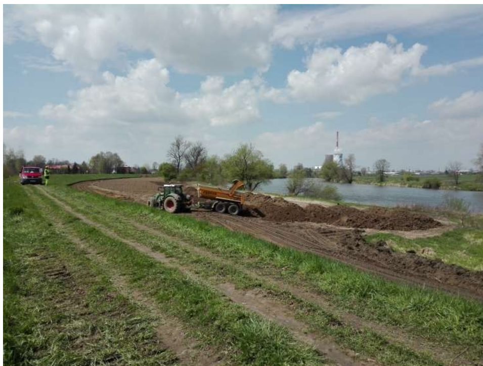
Foto. 87. Securing topsoil heaps – the right Vistula embankment on section 3.2a , condition in the third decade of April 2021 (view upstream).