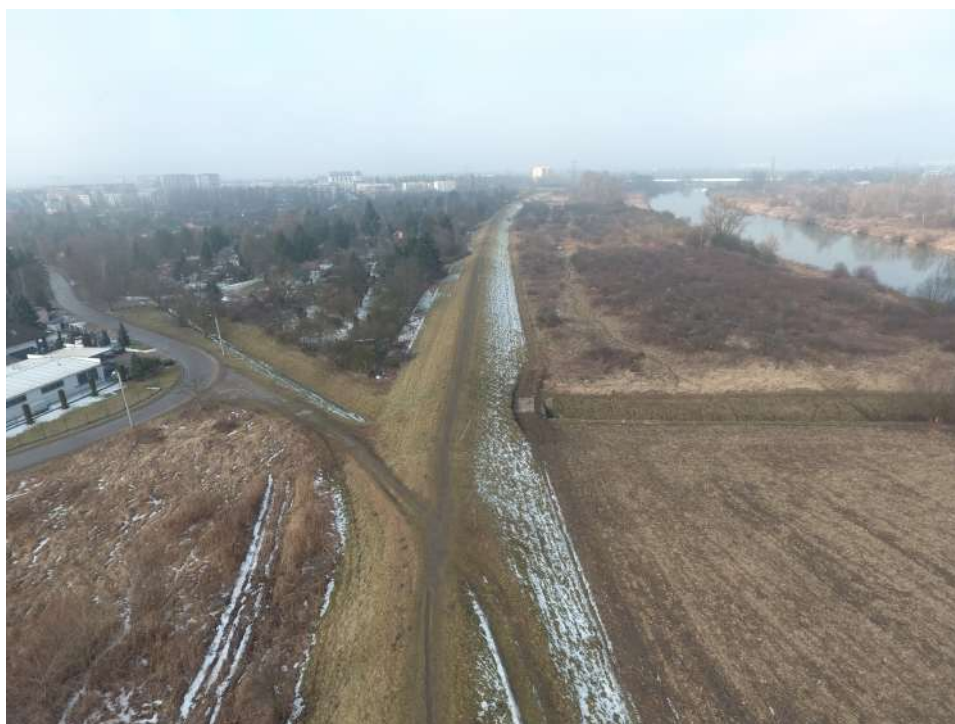
Foto. 58. Condition of the area before the commencement of works – the right Vistula embankment planned for reconstruction on section 3.2a , condition in the first decade of February 2021 (view upstream).