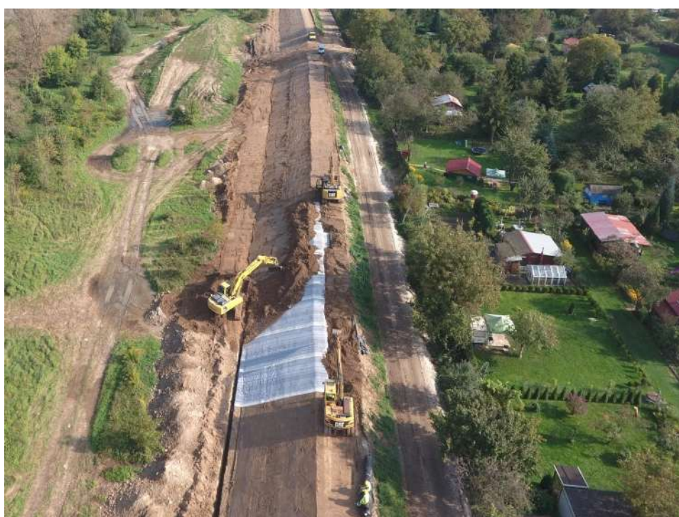
Foto. 106. Laying bentomat on the slope of the flood embankment – the right embankment of the Vistula River on section 3.2a , condition in the third decade of September 2021 (view downstream).