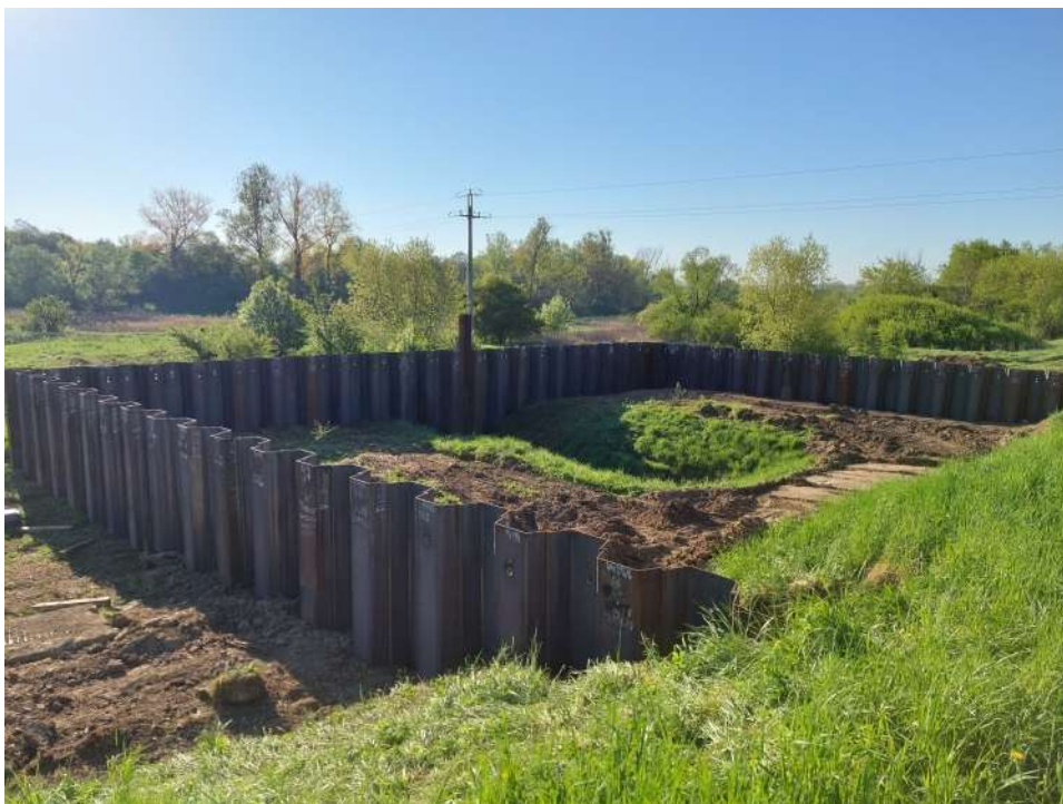
Foto. 92. Sheet pile wall securing the reconstructed embankment culvert – right embankment of the Vistula River on section 3.4 , condition in the second decade of May 2021 (view downstream).