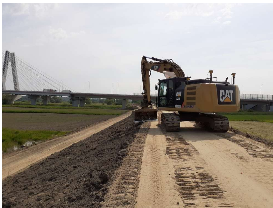
Foto. 108. Topsoiling of flood embankment slopes – right Vistula embankment on section 3.3 , condition in the third decade of May 2023 (view downstream).