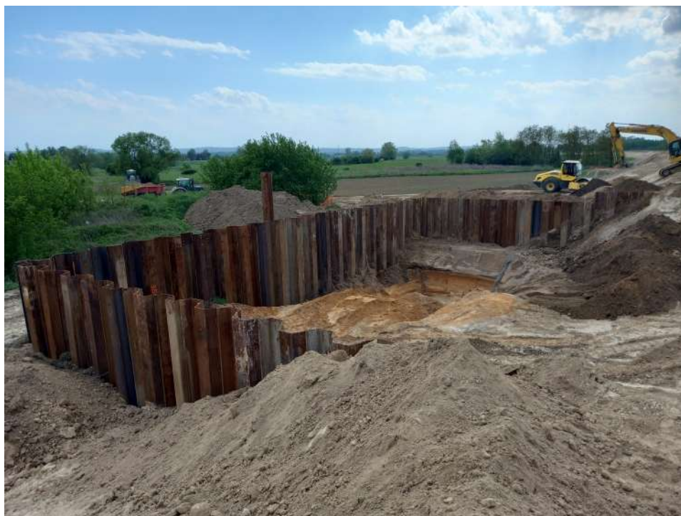
Foto. 33. Reconstruction of the embankment culvert - left embankment of the Vistula River on section 2 , condition in the second decade of May 2022 (view towards the inter-embankment area).