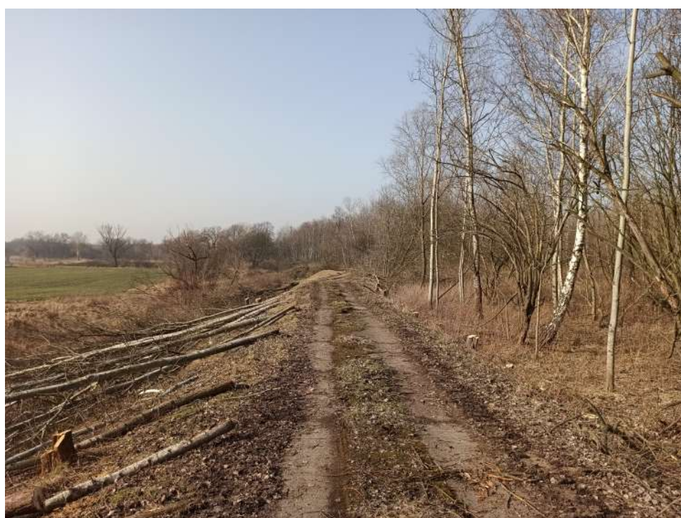
Foto. 10. Construction site after cutting down trees and shrubs – left Vistula embankment on section 1.3 , state in the third decade of March 2021 (view upstream).