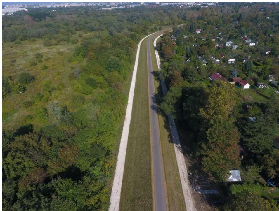
Foto. 113. Condition of the construction site in the last quarter of the works implementation period – rebuilt right Vistula embankment on section 3.1 , condition in the third decade of September 2023 (view downstream).