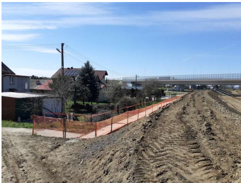
Foto. 75. Securing dangerous places in the vicinity of buildings – the right embankment of the Vistula River on section 3.3 , condition in the third decade of March 2023 (view upstream).