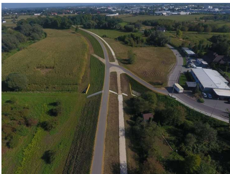
Foto. 114. Condition of the construction site in the last quarter of the works implementation period – rebuilt right Vistula embankment on section 3.2a , condition in the third decade of September 2023 (view downstream).