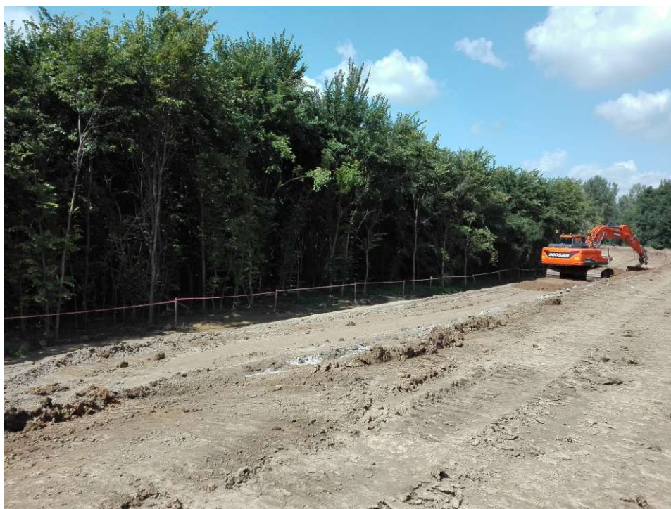
Foto. 21. Securing trees and shrubs not planned for cutting – left Vistula embankment on section 1.3 , condition in the second decade of August 2022 (view upstream).