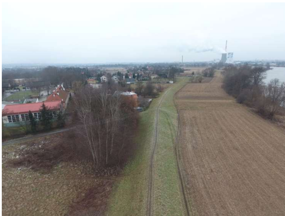
Foto. 59. Condition of the area before the commencement of works – the right Vistula embankment planned for reconstruction on section 3.2b , condition in the first decade of February 2021 (view upstream).