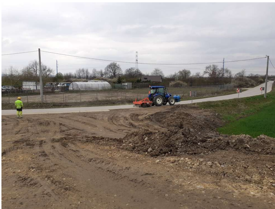
Foto. 83. Maintaining the cleanliness of public roads in the vicinity of the construction site – right bank of the Vistula on section 3.4 , condition in the second decade of April 2023 (view towards the west).