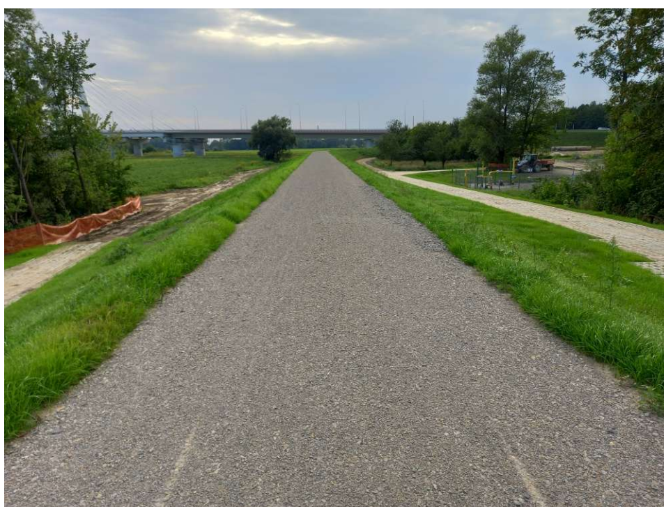
Foto. 48. Growth of grasses sown on the slope of the flood embankment – left Vistula embankment on section 1.2 , state in the third decade of August 2022 (view upstream).