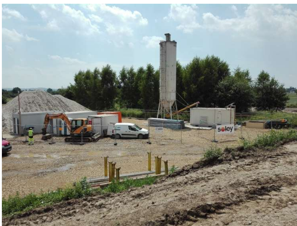
Foto. 90. Installation for producing cement-bentonite mixture – right bank of the Vistula River on section 3.3 , condition in the third decade of June 2021 (view upstream).