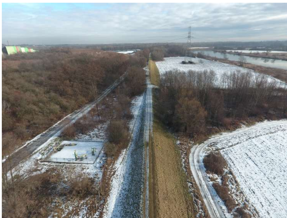
Foto. 2. Condition of the area before the commencement of works – the left Vistula embankment planned for reconstruction on section 1.2 , condition in the first decade of February 2021 (view downstream).