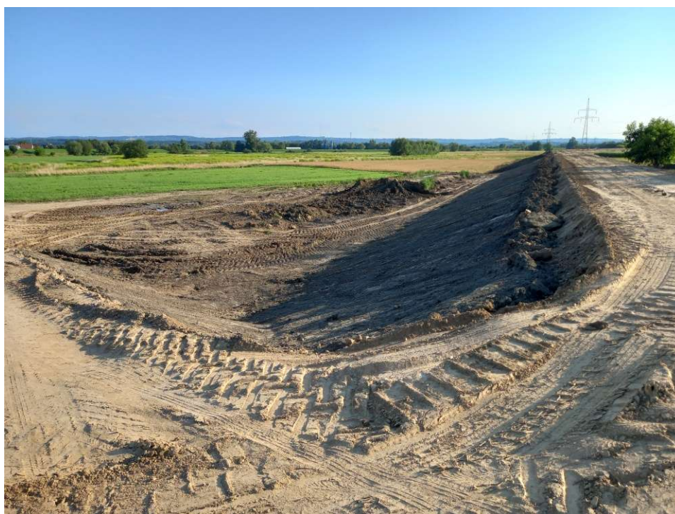
Foto. 44. Topsoiling of flood embankment slopes – left Vistula embankment on section 2 , condition in the third decade of July 2022 (view upstream).