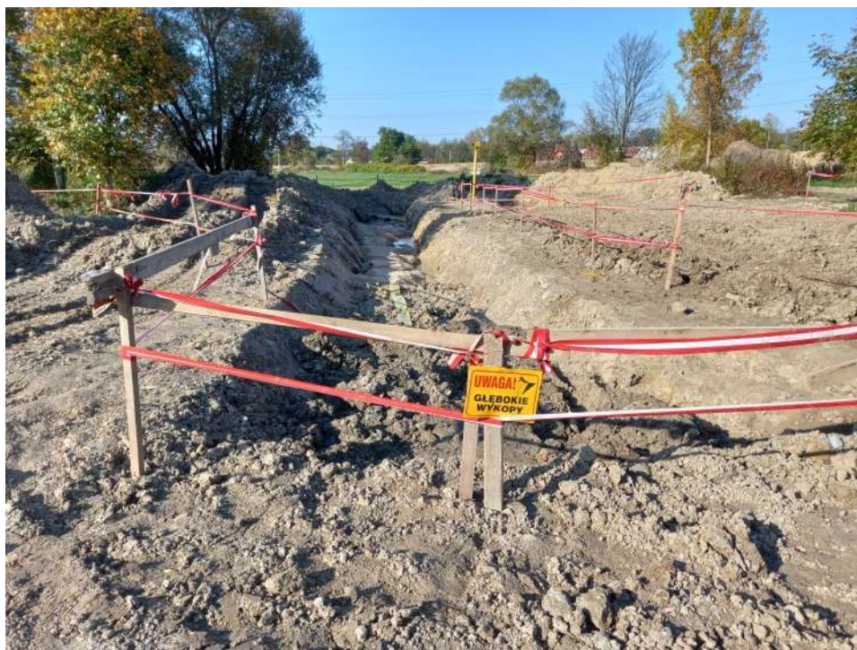
Foto. 17. Securing dangerous places - right bank of Dłubnia on section 1.4 , condition in the second decade of October 2022 (view downstream).