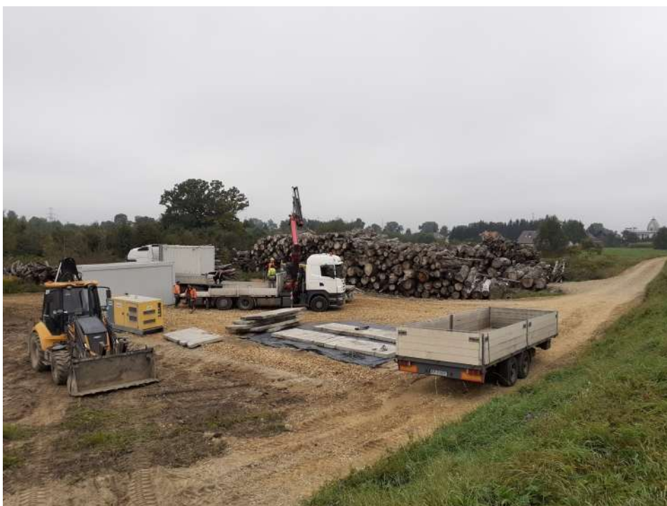
Foto. 66. Storage yard on the right bank of the Vistula embankment – the right bank of the Vistula on section 3.4 , state in the third decade of September 2021 (view upstream).