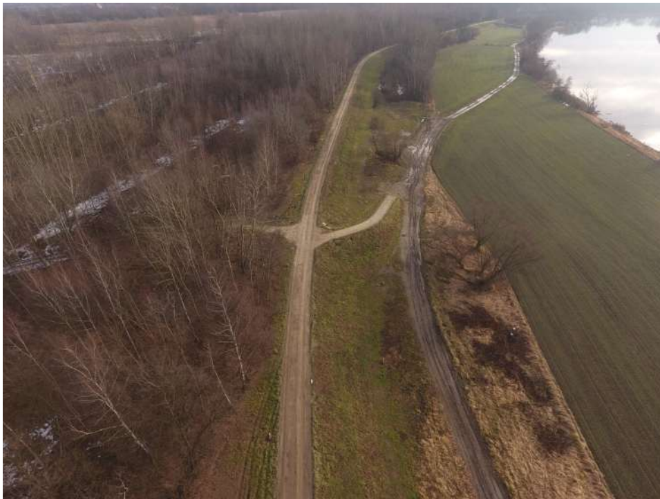
Foto. 51. Condition of the construction site in the last quarter of the works implementation period – rebuilt left Vistula embankment on section 1.3 , condition in the third decade of December 2022 (view downstream).