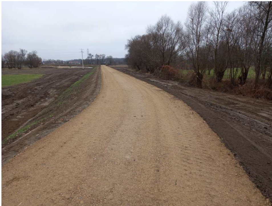
Foto. 45. Road construction on the top of the flood embankment – left embankment of Dłubnia on section 1.6 , condition in the third decade of November 2022 (view downstream).