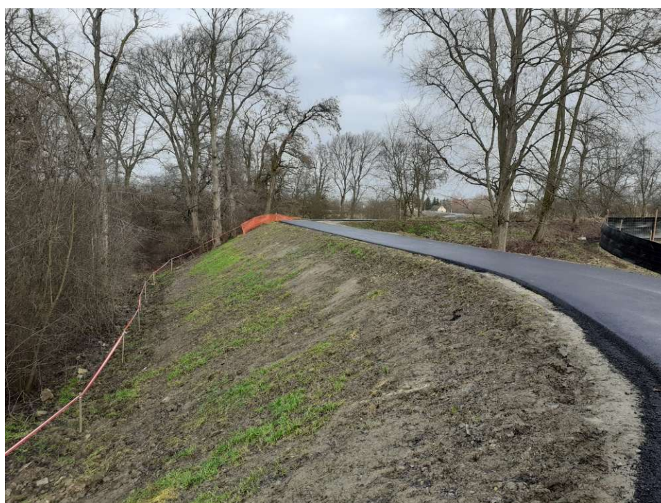
Foto. 80. Securing the tree stand within the boundaries of Fort 50a Lasówka (object entered in the register of monuments) - the right bank of the Vistula River on section 3.2a , condition in the third decade of January 2023 (view downstream).