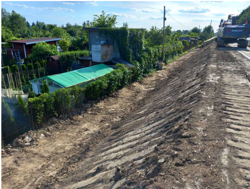
Foto. 39. Leveling the slopes of the flood embankment – the left embankment of the Vistula River on section 1.1 , condition in the second decade of June 2022 (view upstream).