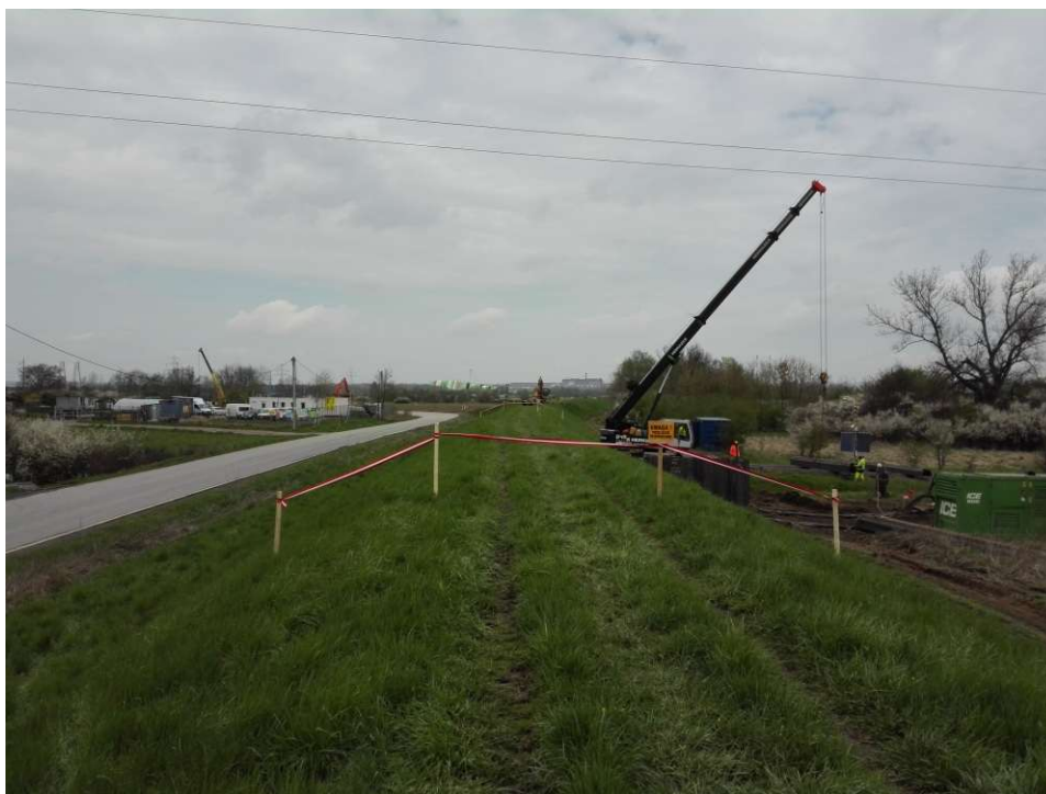
Foto. 71. Securing dangerous places – right bank of the Vistula on section 3.4 , state in the third decade of April 2021 (view upstream).