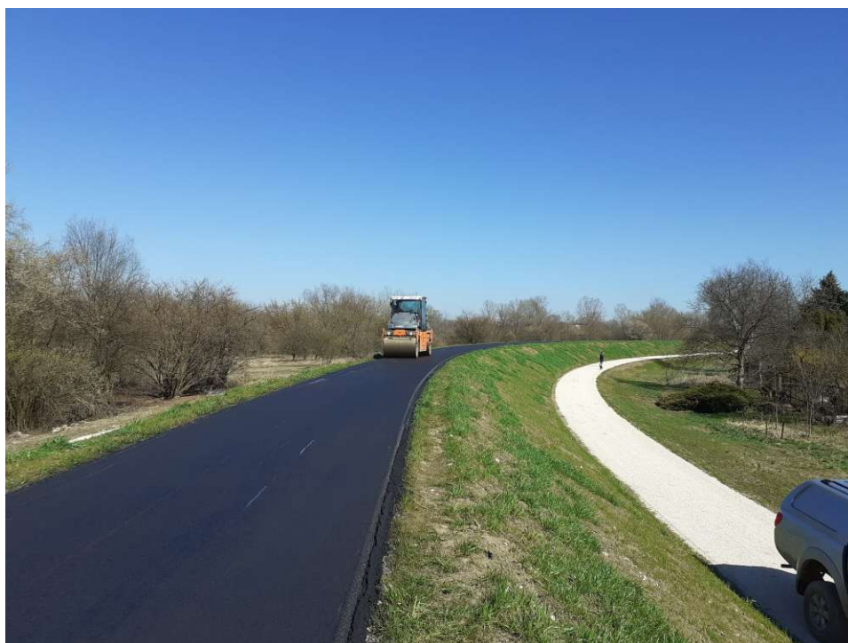
Foto. 110. Construction of a road on the top of the flood embankment – the right embankment of the Vistula River on section 3.1 , state in the third decade of March 2023 (view downstream).