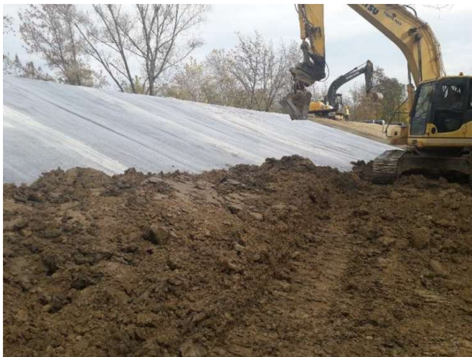
Foto. 41. Laying bentomat on the slope of the flood embankment – left Vistula embankment on section 1.2 , condition in the third decade of October 2021 (view downstream).