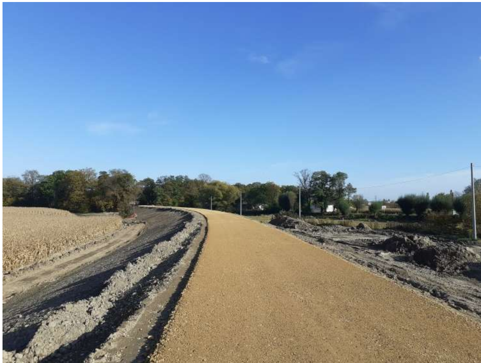
Foto. 109. Construction of a road on the top of the flood embankment – the right embankment of the Vistula River on section 3.2a , condition in the second decade of October 2022 (view downstream).