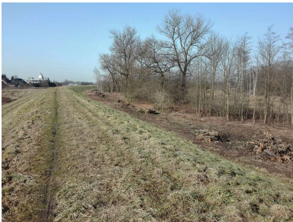
Foto. 63. Construction site after cutting down trees and shrubs – the right Vistula embankment on section 3.4 , condition in the third decade of February 2021 (view upstream).