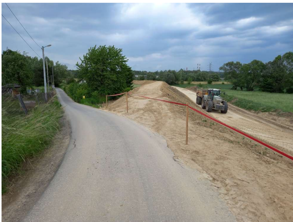
Foto. 14. Construction site marking – right embankment of Dłubnia on section 1.4 , condition in the third decade of May 2022 (view upstream).