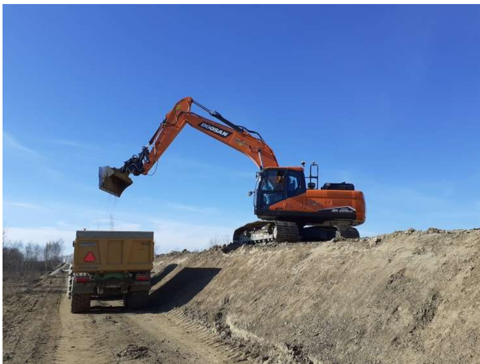
Foto. 103. Leveling the slopes of the flood embankment – the right embankment of the Vistula River on section 3.3 , state in the third decade of February 2022 (view upstream).