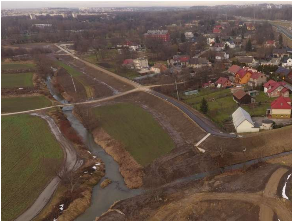
Foto. 53. Condition of the construction site in the last quarter of the works implementation period – rebuilt left embankment of Dłubnia on section 1.5 , condition in the third decade of December 2022 (view upstream).