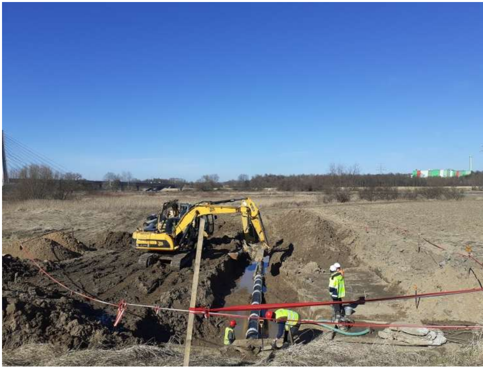
Foto. 97. Works related to the reconstruction of the gas pipeline network – the right embankment of the Vistula River on section 3.3 , condition in the third decade of February 2022 (view towards the inter-embankment area).