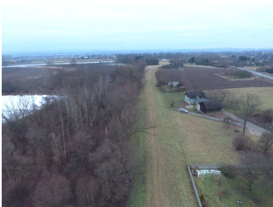
Foto. 4. Condition of the area before the commencement of works – the right embankment of Dłubnia planned for reconstruction on section 1.4 , condition in the first decade of February 2021 (view downstream).