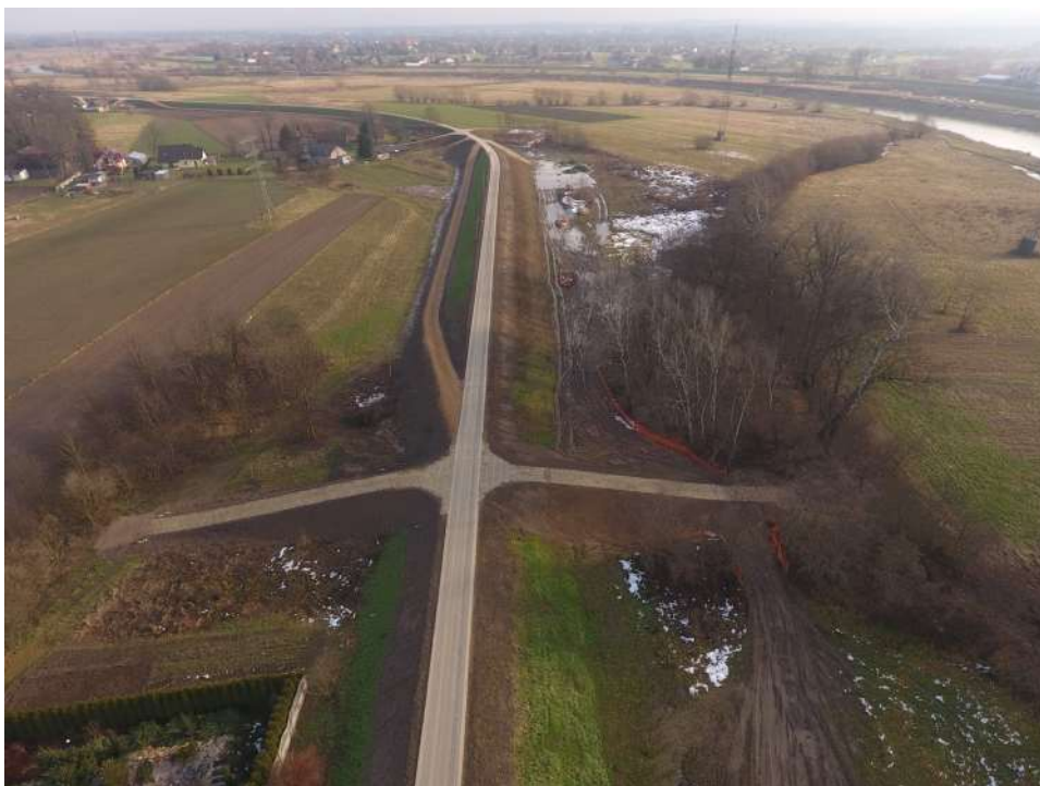
Foto. 56. Condition of the area after completion of works – rebuilt left Vistula embankment on section 2 – lower part, condition in the third decade of December 2022 (view downstream).