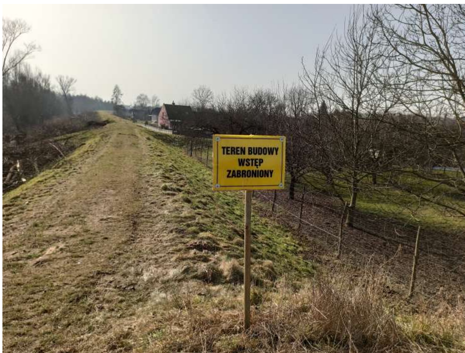
Foto. 13. Construction site marking – right embankment of Dłubnia on section 1.4 , condition in the third decade of February 2021 (view downstream).