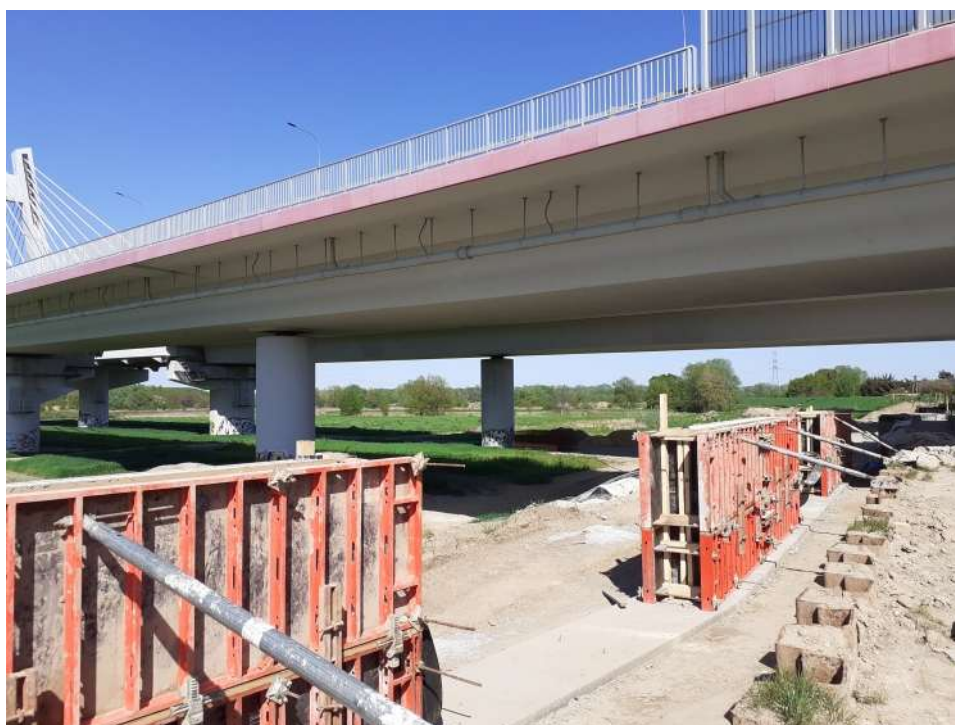
Foto. 96. Construction of a retaining wall – the right Vistula embankment on section 3.3 , state in the first decade of May 2022 (view downstream).