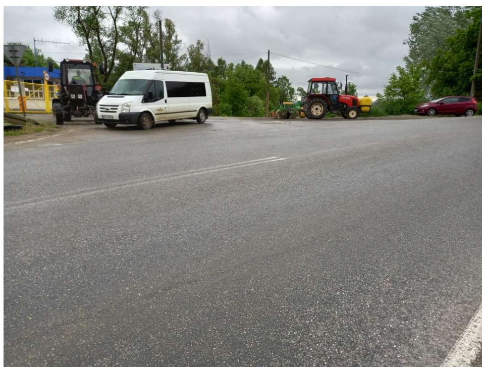
Foto. 24. Maintaining the cleanliness of public roads in the vicinity of the construction site – left bank of the Dłubnia River on section 1.5 , condition in the third decade of May 2022 (view downstream).