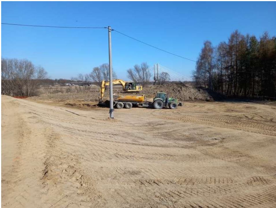
Foto. 11. Storage yard on the right bank of the Dłubnia embankment – right bank of the Dłubnia on section 1.4 , state in the third decade of March 2022 (view upstream).