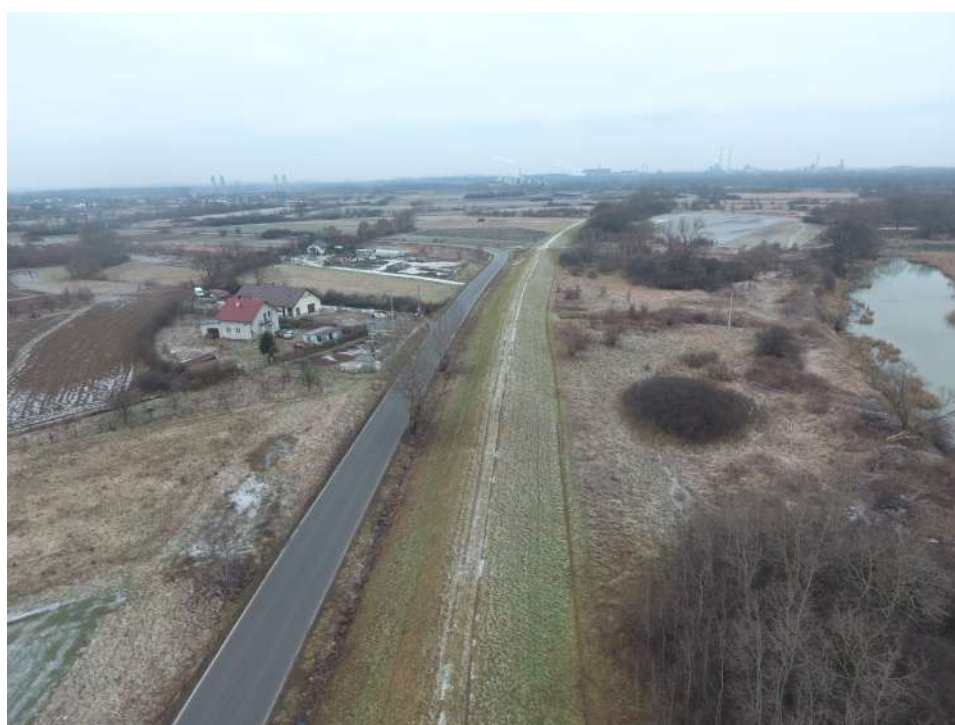
Foto. 62. Condition of the area before the commencement of works – the right Vistula embankment planned for reconstruction on section 3.4 , condition in the first decade of February 2021 (view upstream).