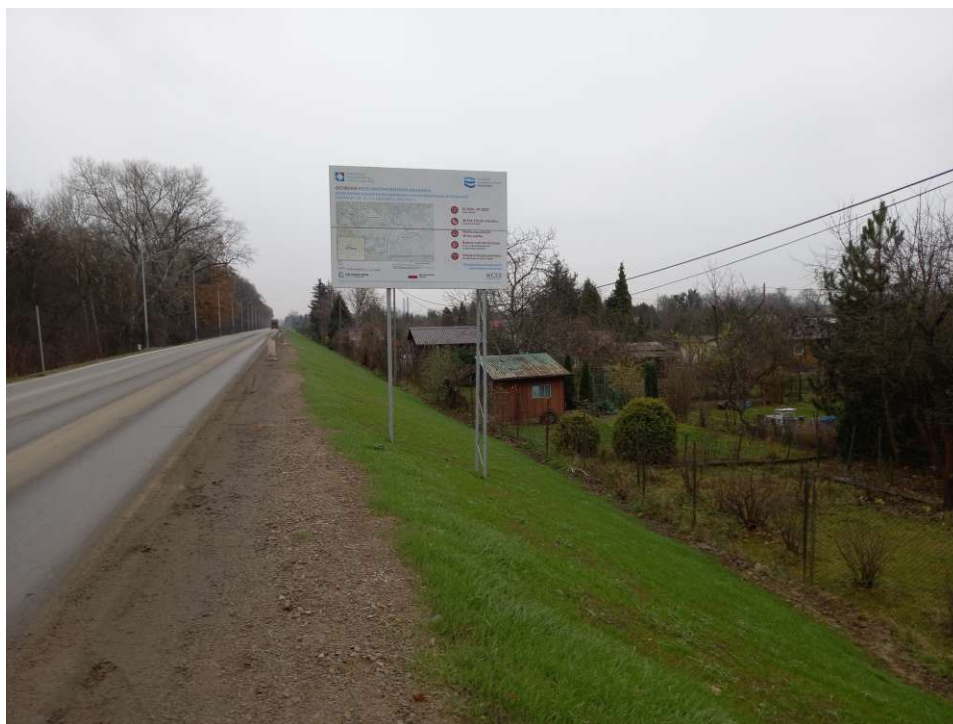
Foto. 47. Growth of grasses sown on the slope of the flood embankment – left embankment of the Vistula River on section 1.1 , state in the third decade of November 2022 (view downstream).