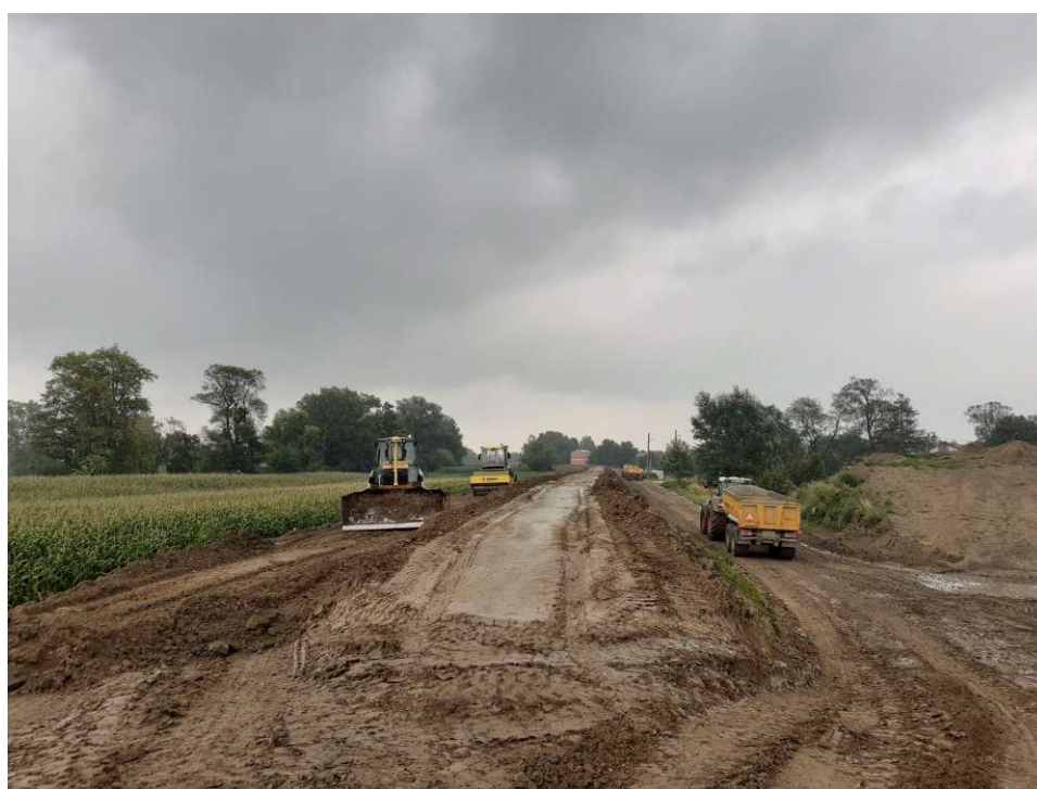
Foto. 100. Transport of earth masses for the reconstruction of the flood embankment – the right embankment of the Vistula River on section 3.2b , condition in the third decade of July 2022 (view downstream).