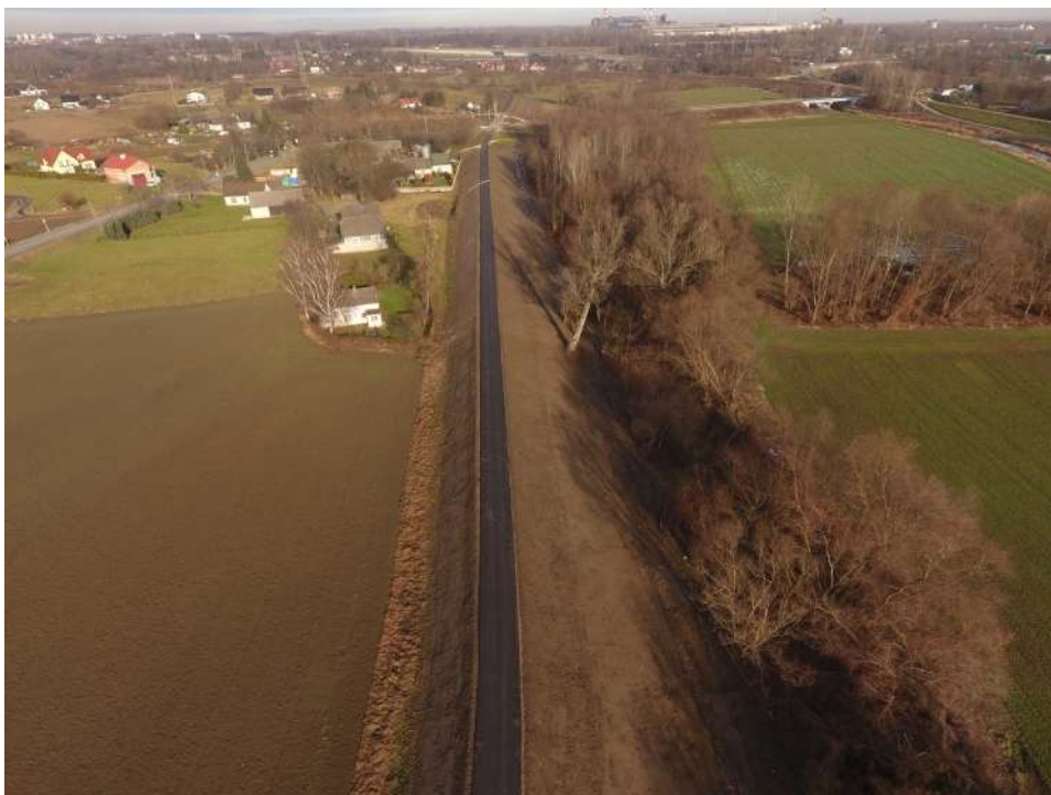
Foto. 52. Condition of the construction site in the last quarter of the works implementation period – rebuilt right embankment of Dłubnia on section 1.4 , condition in the third decade of December 2022 (view upstream).