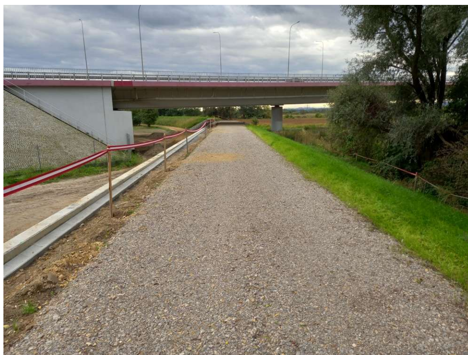
Foto. 18. Securing dangerous places – left embankment of Dłubnia on section 1.5 , condition in the third decade of September 2022 (view downstream).