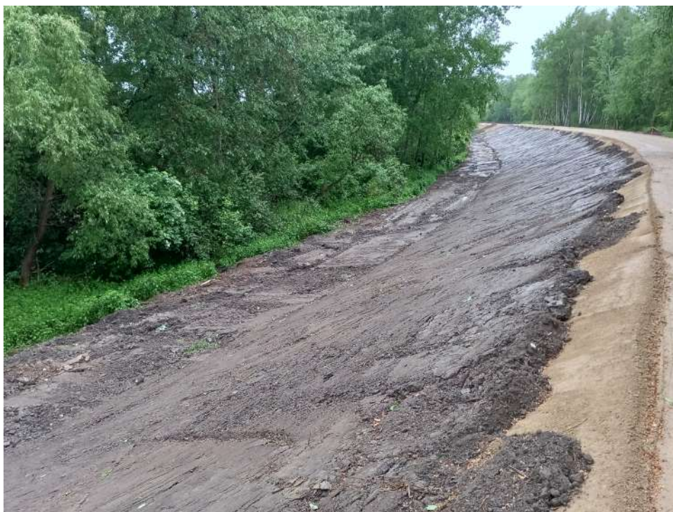
Foto. 43. Topsoiling of flood embankment slopes – left Vistula embankment on section 1.3 , condition in the third decade of May 2022 (view upstream).