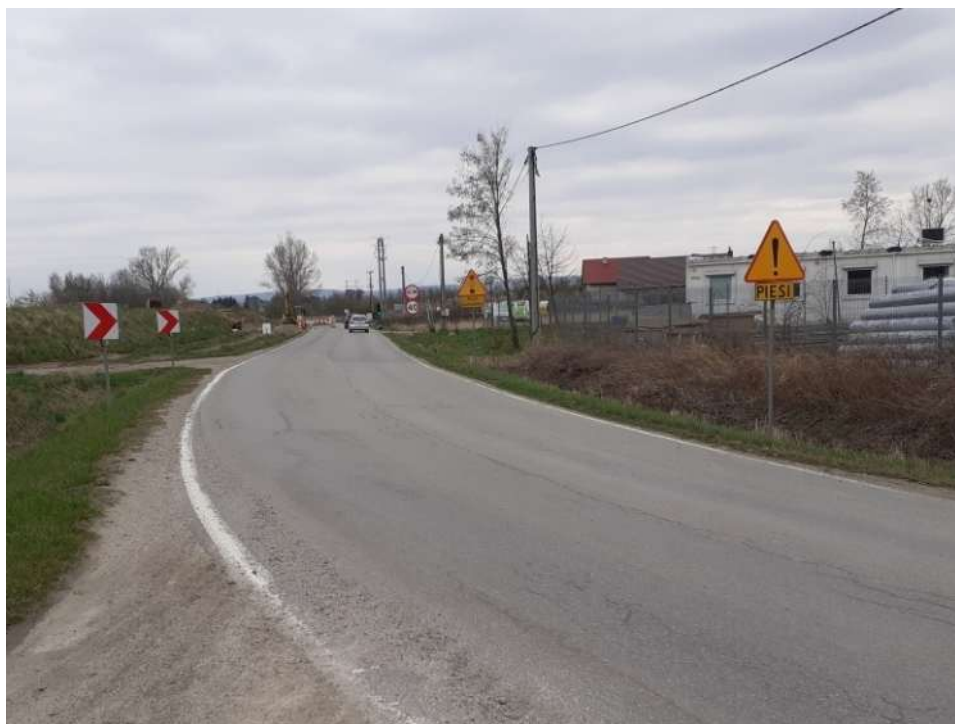
Foto. 69. Public road marking in the vicinity of the construction site – the right Vistula embankment on section 3.4 , condition in the second decade of April 2021 (view downstream).