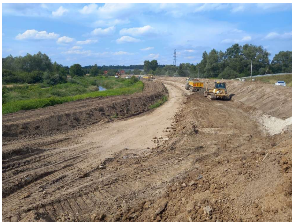
Foto. 38. Formation of flood embankment slopes – left embankment of Dłubnia on section 1.5 , condition in the third decade of July 2022 (view upstream).