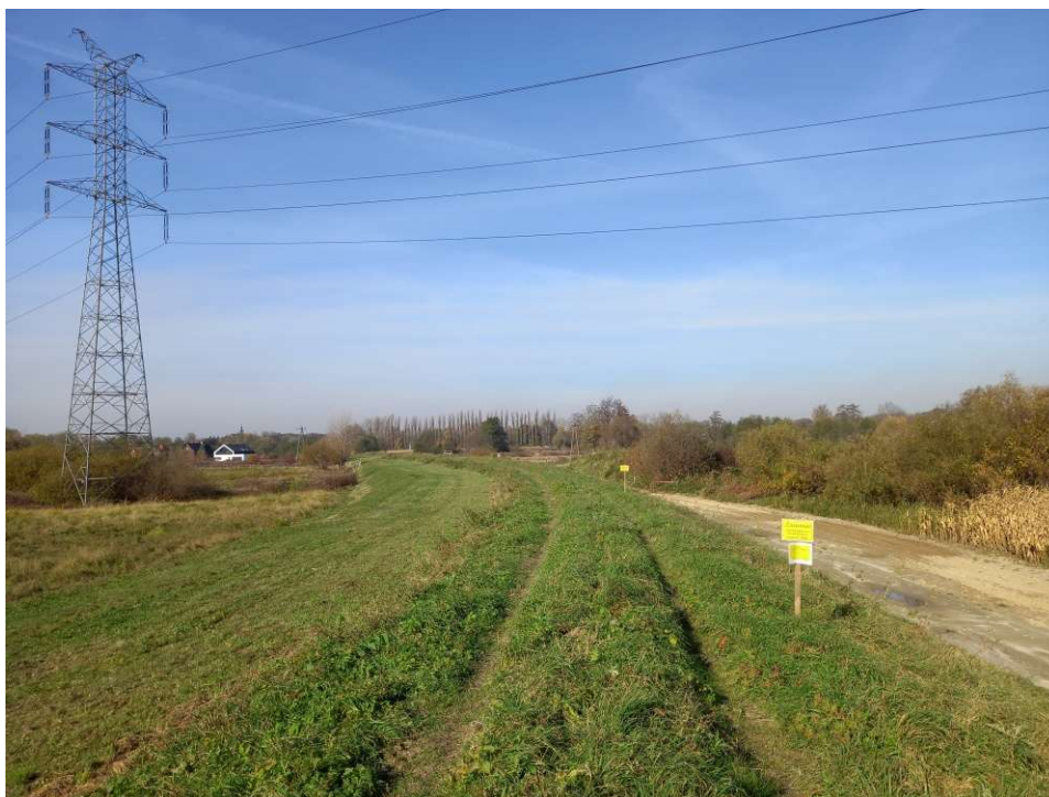
Foto. 19. Securing dangerous places under the power line – right bank of Dłubnia on section 1.4 , state in the third decade of October 2021 (view upstream).