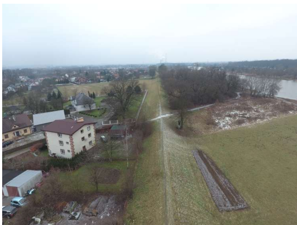
Foto. 60. Condition of the area before the commencement of works – the right Vistula embankment planned for reconstruction on section 3.3 – upper part, condition in the first decade of February 2021 (view upstream).