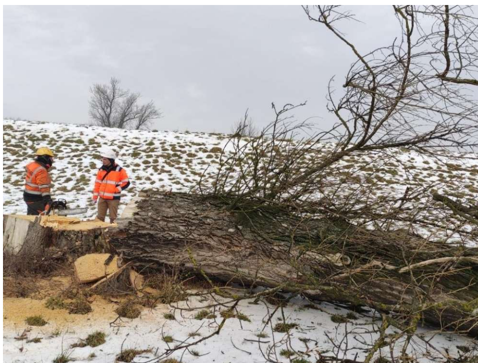
Foto. 9. Tree and shrub cutting – left Vistula embankment on section 2 , state in the second decade of February 2021 (view downstream).