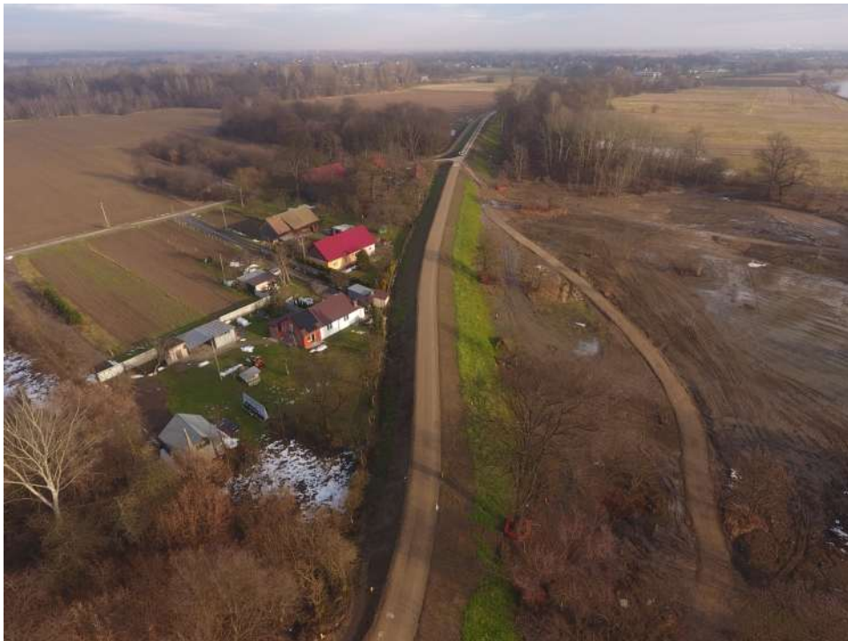
Foto. 55. Condition of the area after completion of works – rebuilt left Vistula embankment on section 2 – upper part, condition in the third decade of December 2022 (view downstream).