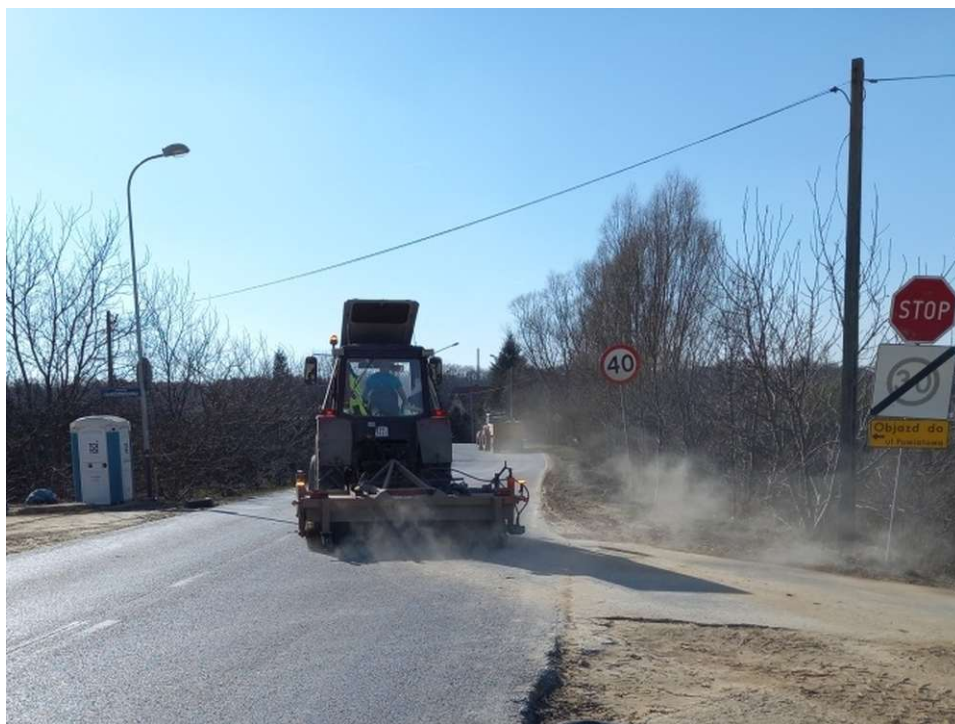
Foto. 23. Maintaining the cleanliness of public roads in the vicinity of the construction site – right bank of the Dłubnia River on section 1.4 , condition in the third decade of March 2022 (view towards the west).