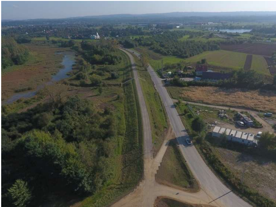
Foto. 118. Condition of the construction site in the last quarter of the works implementation period – rebuilt right Vistula embankment on section 3.4 , condition in the third decade of September 2023 (view downstream).