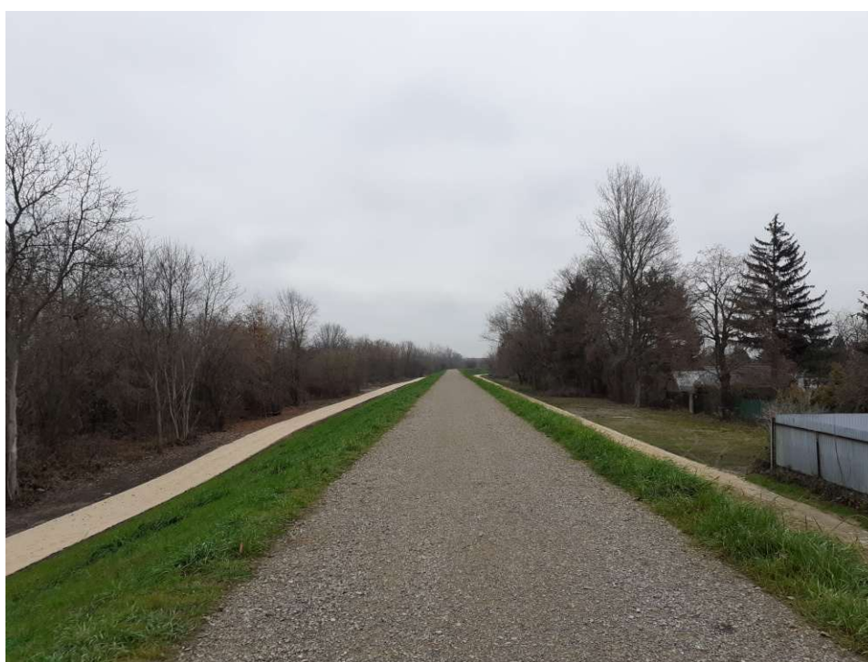
Foto. 112. Growth of grasses sown on the slope of the flood embankment – the right embankment of the Vistula River on section 3.1 , state in the third decade of November 2022 (view downstream).