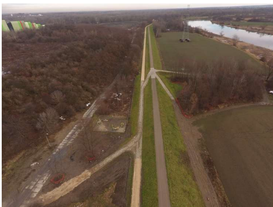
Foto. 50. Condition of the construction site in the last quarter of the works implementation period – rebuilt left Vistula embankment on section 1.2 , condition in the third decade of December 2022 (view downstream).