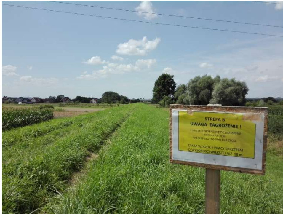
Foto. 73. Securing dangerous places under the power line – the right embankment of the Vistula River on section 3.3 , state in the third decade of July 2021 (view upstream).