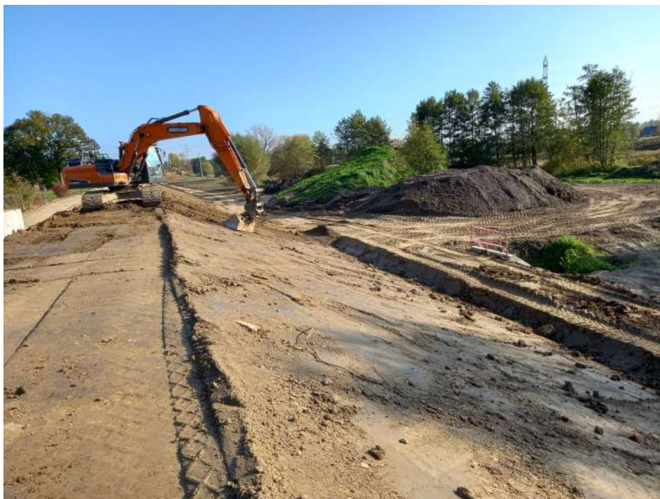
Foto. 40. Leveling the slopes of the flood embankment – left embankment of Dłubnia on section 1.6 , condition in the second decade of October 2022 (view downstream).