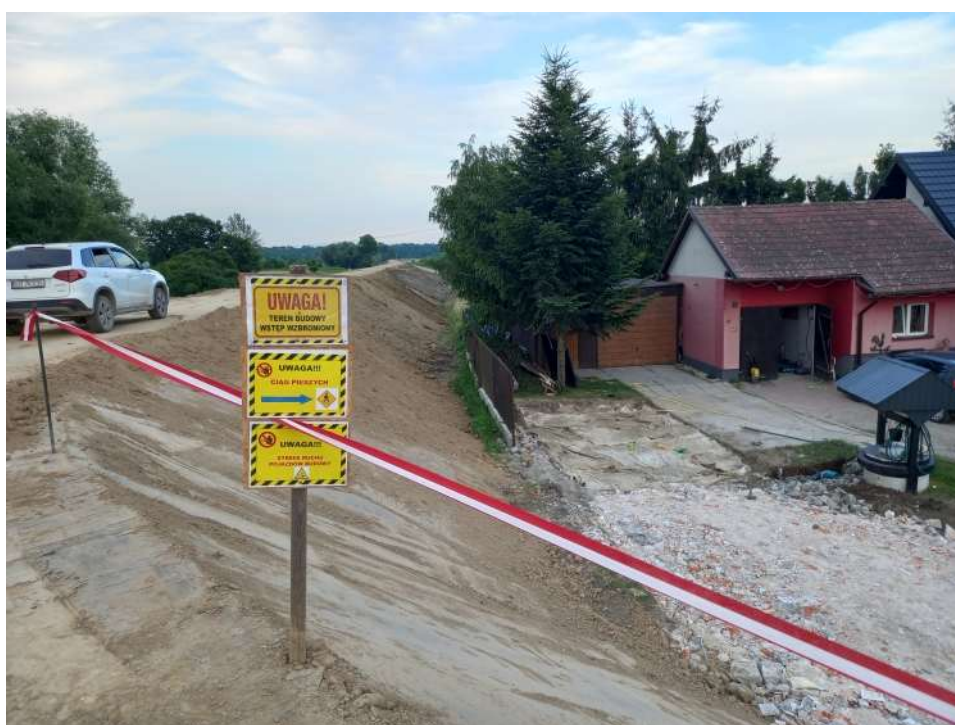
Foto. 76. Securing dangerous places in the vicinity of buildings – the right embankment of the Vistula River on section 3.3 , condition in the third decade of June 2023 (view downstream).