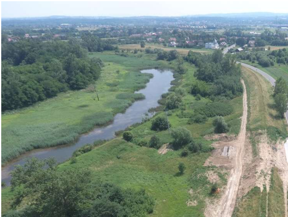
Foto. 81. No impact of works on the condition of natural habitats in the area of the Vistula oxbow lake in the vicinity of the town of Brzegi – the right Vistula embankment on section 3.4 , condition in the third decade of June 2022 (view downstream).