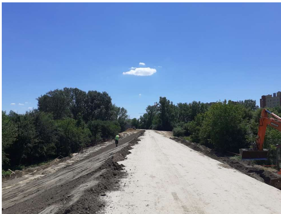
Foto. 107. Topsoiling of flood embankment slopes – right Vistula embankment on section 3.2a , condition in the third decade of June 2022 (view downstream).