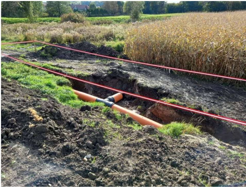
Foto. 35. Works related to the reconstruction of the gas pipeline network – the right embankment of Dłubnia on section 1.4 , condition in the second decade of October 2021 (view downstream).