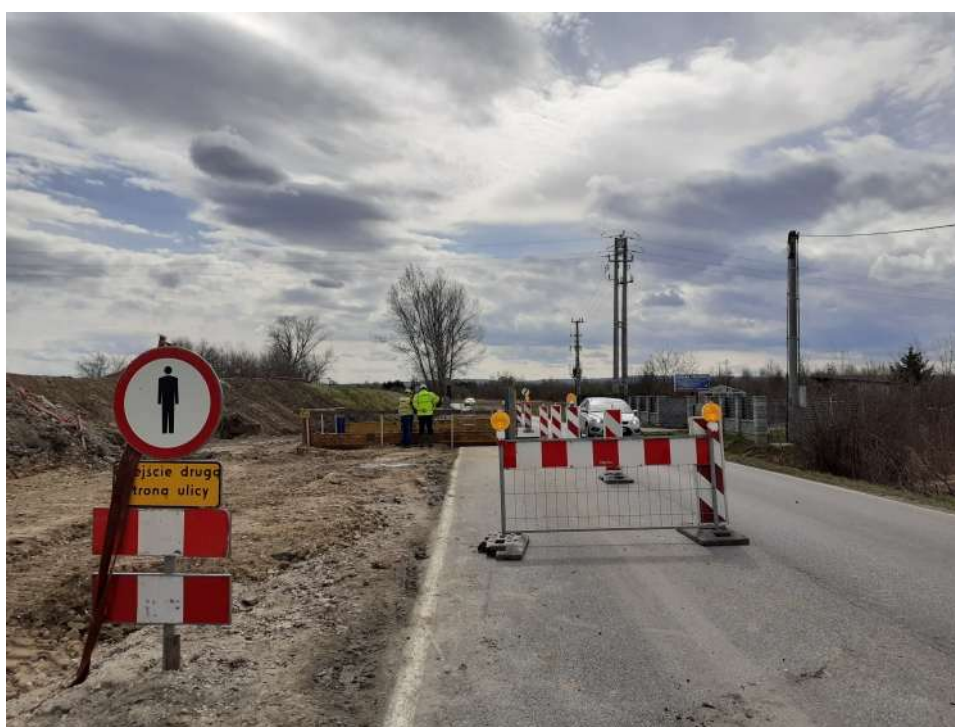
Foto. 70. Public road marking in the vicinity of the construction site – the right Vistula embankment on section 3.4 , state in the first decade of April 2022 (view downstream).