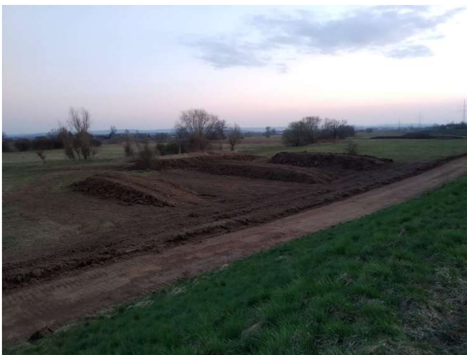
Foto. 28. Securing topsoil heaps – left Vistula embankment on section 2 , state in the third decade of July 2021 (view upstream).