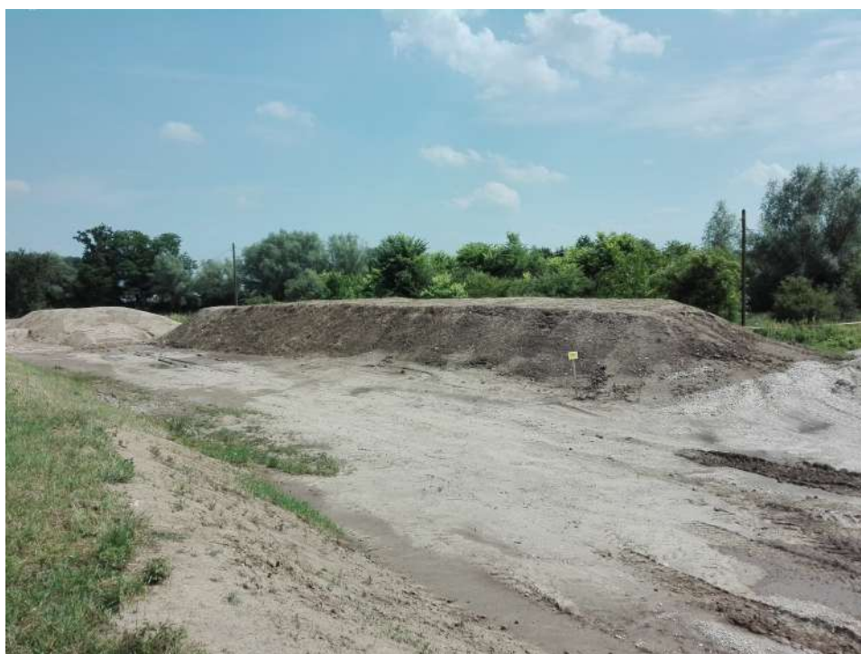
Foto. 88. Securing topsoil heaps – the right Vistula embankment on section 3.2a , condition in the third decade of June 2021 (view downstream).