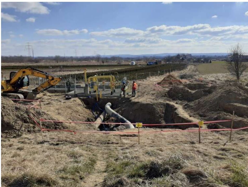
Foto. 98. Works related to the reconstruction of the gas pipeline network – the right embankment of the Vistula River on section 3.3 , state in the first decade of March 2022 (view towards the embankment).