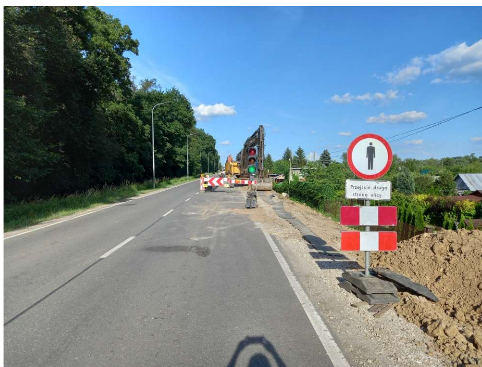
Foto. 16. Public road marking in the vicinity of the construction site – the right embankment of the Vistula River on section 1.1 , condition in the third decade of June 2022 (view downstream).