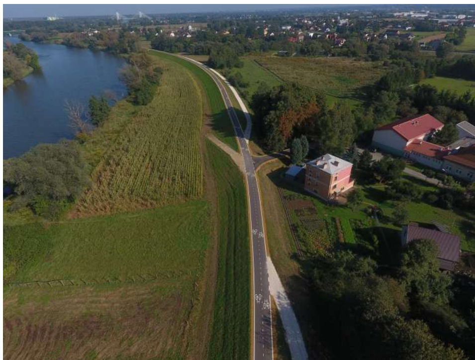
Foto. 115. Condition of the construction site in the last quarter of the works implementation period – rebuilt right Vistula embankment on section 3.2b , condition in the third decade of September 2023 (view downstream).