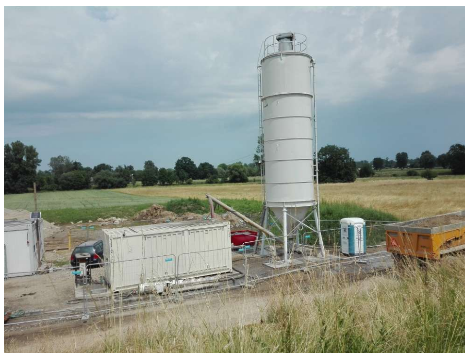
Foto. 30. Installation for the production of cement-bentonite mixture – left bank of the Vistula River on section 2 , condition in the third decade of June 2021 (view downstream).