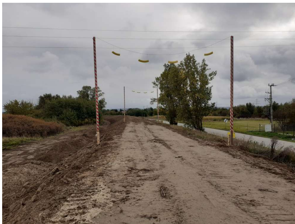
Foto. 74. Securing dangerous places under the power line – the right embankment of the Vistula River on section 3.4 , state in the third decade of September 2022 (view downstream).