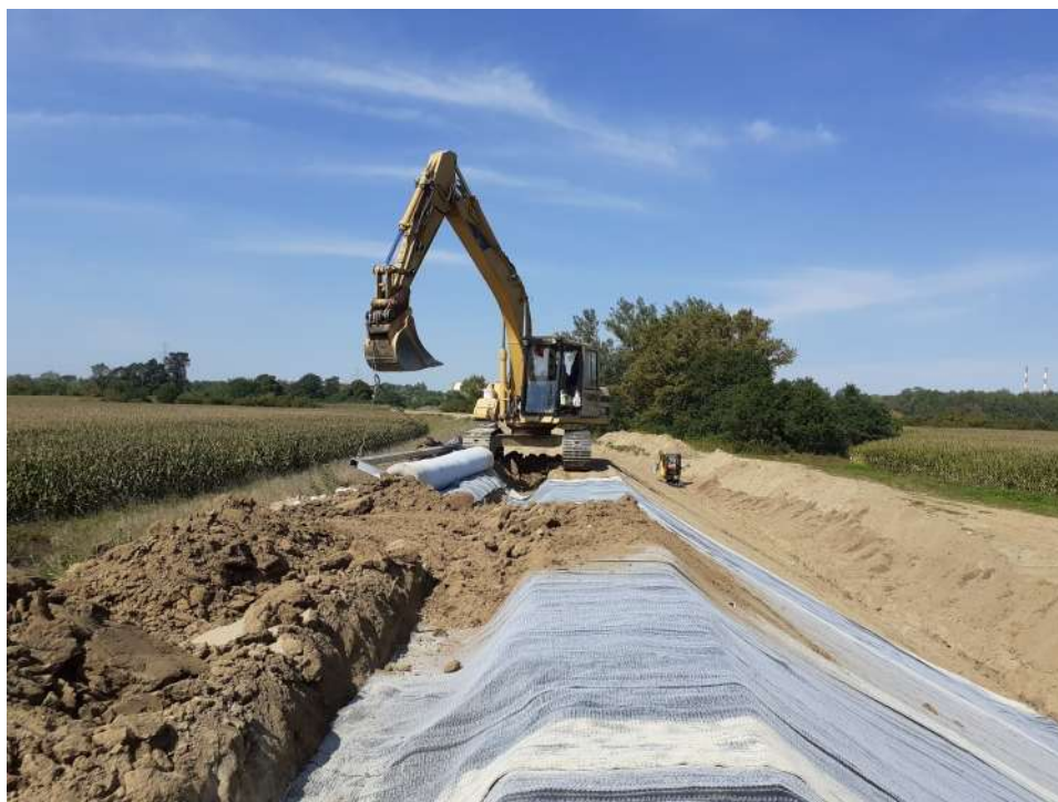
Foto. 105. Laying bentomat on the slope of the flood embankment – the right embankment of the Vistula River on section 3.3 , state in the first decade of September 2022 (view upstream).