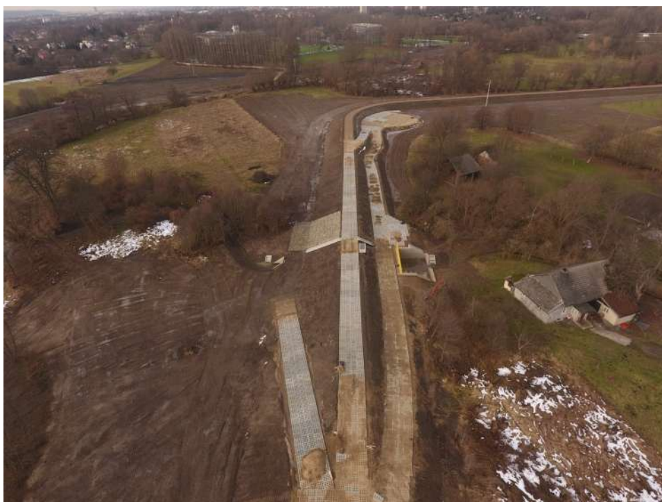
Foto. 54. Condition of the construction site in the last quarter of the works implementation period – newly built left embankment of Dłubnia on section 1.6 , condition in the third decade of December 2022 (view upstream).