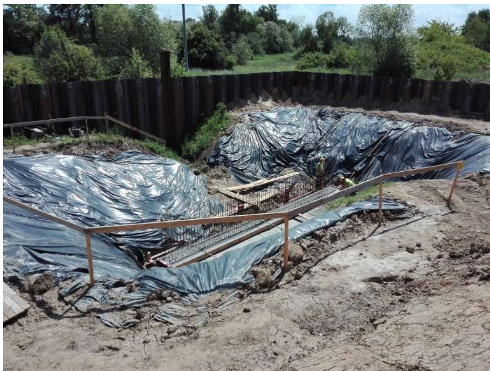
Foto. 93. Reconstruction of the embankment culvert – the right embankment of the Vistula River on section 3.4 , condition in the third decade of May 2021 (view downstream).