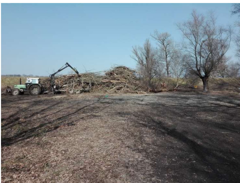
Foto. 64. Tidying up the construction site after cutting down trees and shrubs – the right Vistula embankment on section 3.2b , condition in the third decade of February 2021 (view downstream).