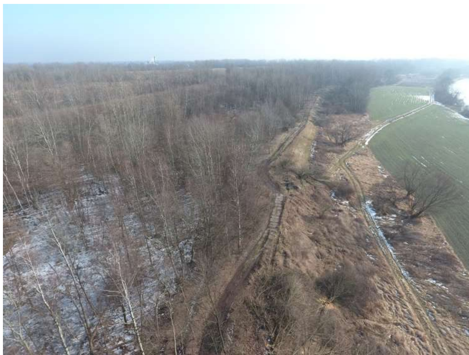
Foto. 3. Condition of the area before the commencement of works – the left Vistula embankment planned for reconstruction on section 1.3 , condition in the third decade of February 2021 (view downstream).