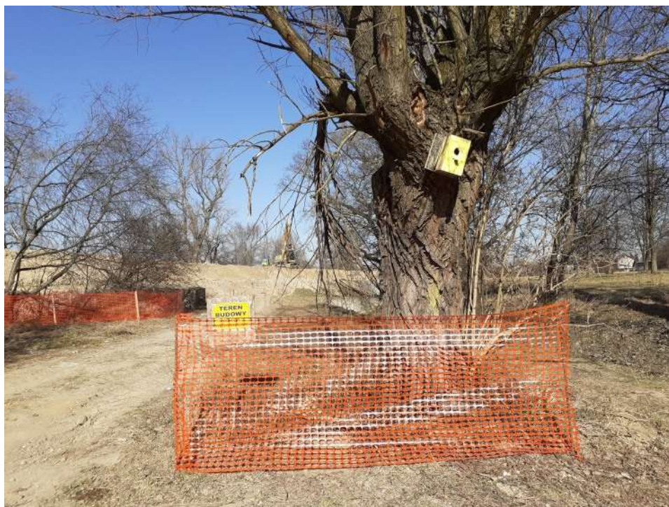
Foto. 79. Securing trees and shrubs not planned for cutting – the right Vistula embankment on section 3.2b , state in the third decade of March 2022 (view downstream).