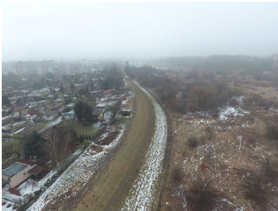
Foto. 57. Condition of the area before the commencement of works – the right Vistula embankment planned for reconstruction on section 3.1 , condition in the first decade of February 2021 (view upstre).