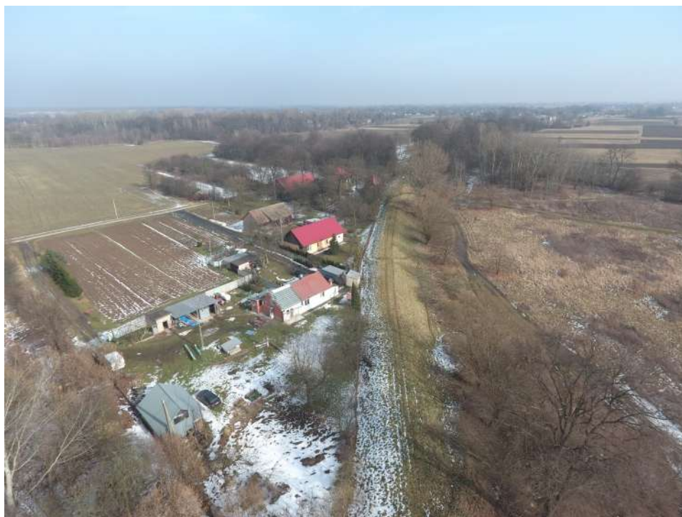
Foto. 7. Condition of the area before the commencement of works – the left Vistula embankment planned for reconstruction on section 2 – upper part, condition in the third decade of February 2021 (view downstream).