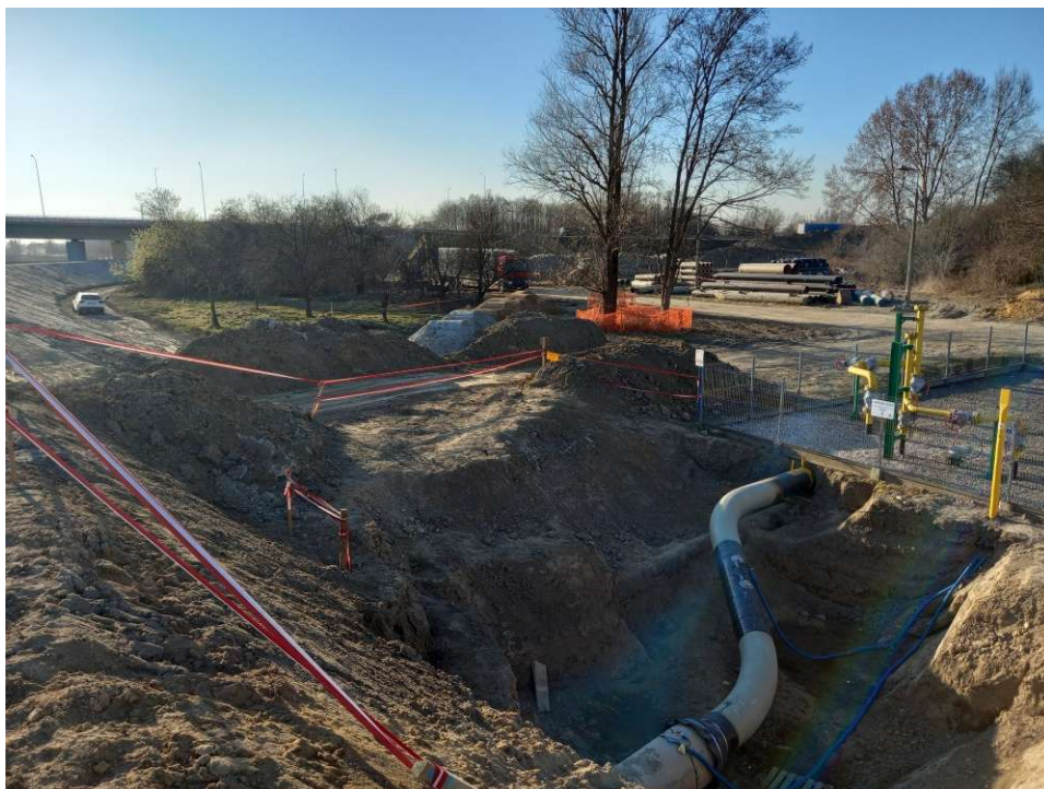
Foto. 36. Works related to the reconstruction of the gas pipeline network – the left embankment of the Vistula River on section 1.2 , state in the third decade of March 2022 (view upstream).