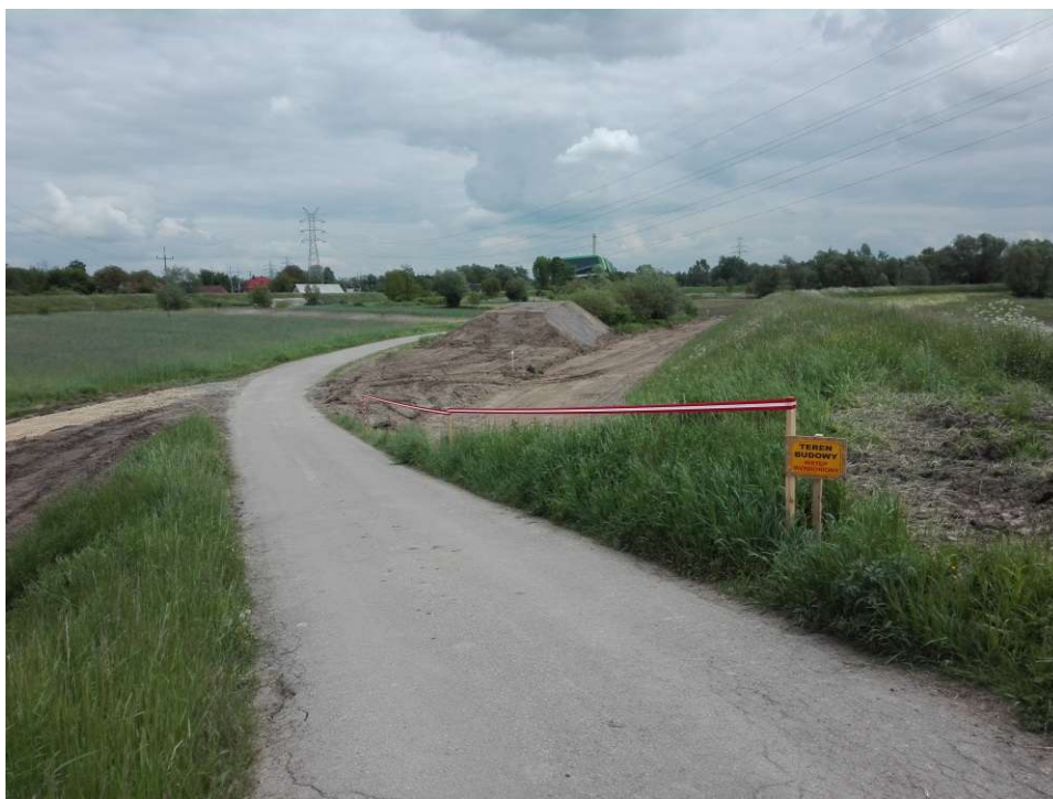
Foto. 27. Securing topsoil heaps – right embankment of Dłubnia on section 1.4 , condition in the third decade of May 2022 (view downstream).