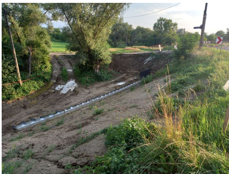
Foto. 32. Execution of the cap on the sheet pile wall at the base of the embankment – left Vistula embankment on section 1.1 , condition in the third decade of July 2022 (view upstream).